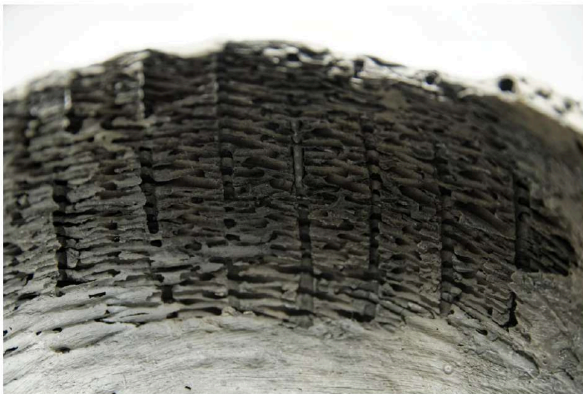
Frédéric Mulatier, wicker sculpture "Empreintée," detail — clay, wicker, D 30 x H 20 cm, 2020.