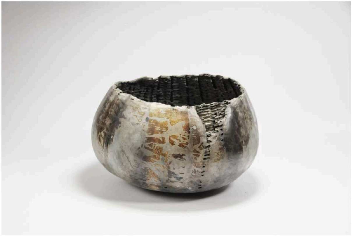
Frédéric Mulatier, wicker sculpture "Empreintée" — clay, wicker, D 30 x H 20 cm, 2020.