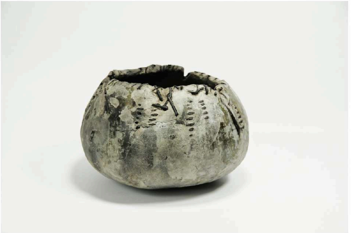
Frédéric Mulatier, wicker sculpture "Lapilli" — clay, wicker, D 30 x H 22 cm, 2020.

Each artwork is the result of a creative process based on association of ideas, with Pompeii and plate tectonics at the forefront. Stemming from an instinctive quest for emotion, all four of these new creations go back to the intertwined roots of basketry and pottery.