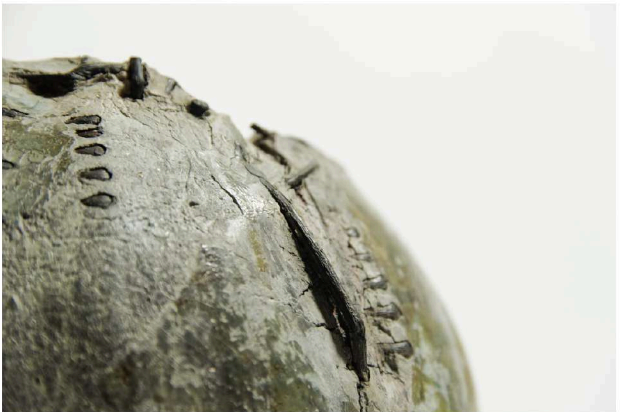
Frédéric Mulatier, wicker sculpture "Lapilli," detail — clay, wicker, D 30 x H 22 cm, 2020.