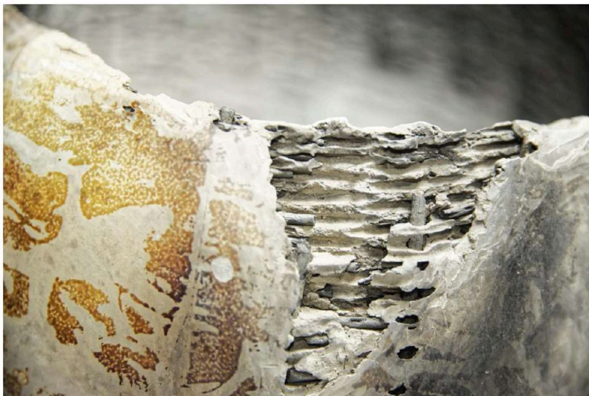
Frédéric Mulatier, wicker sculpture "Empreintée," detail — clay, wicker, D 30 x H 20 cm, 2020.