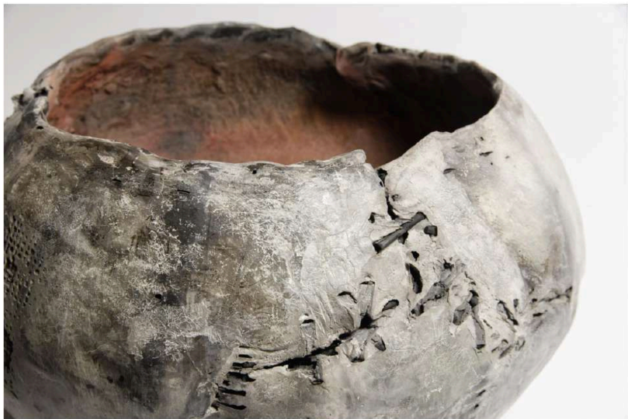
Frédéric Mulatier, wicker sculpture "Rescapée" — clay, wicker, D 38 x H 21 cm, 2020.