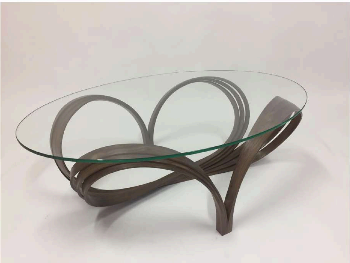
Pierre Renart - Ecllosion Coffee Table, American walnut and glass tabletop, D110 x H40 cm.

Pierre Renart's first collection, the Genesis Collection pushes the boundaries of contemporary design and craftsmanship. Based on art deco-inspired esthetics, the Genesis Collection is a new take on development processes. It reinvents the elegance of curves through the most innovative techniques.