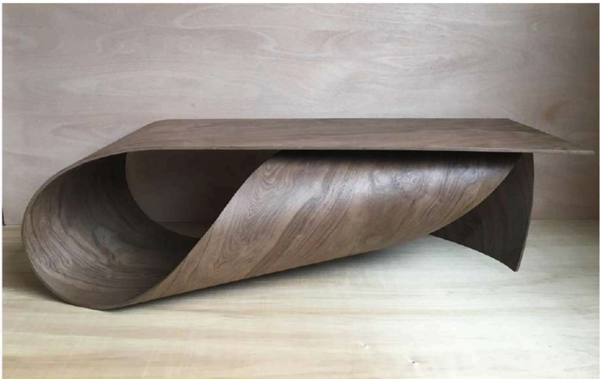
Pierre Renart – Wave Coffee Table, American walnut, 160 x 60 x 45 cm.

Within the Ribbon Collection, the Wave wall console is shaped as a wood ribbon whose elegant loop gently closes against the tabletop. Also inspired by the organic form of waves, this wall console seems to effortlessly float, beautifully hovering above the floor.