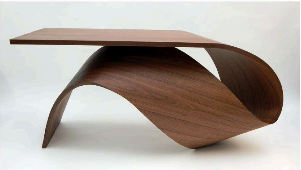
Pierre Renart — Wave desk, American walnut, 205 x 95 x 75 cm.

Shaped as a boundless wood ribbon that seems to come full circle ad infinitum, the symbolic shape of the Möbius console (and recently, of the Möbius bench as well) is an incomparable technical prowess.