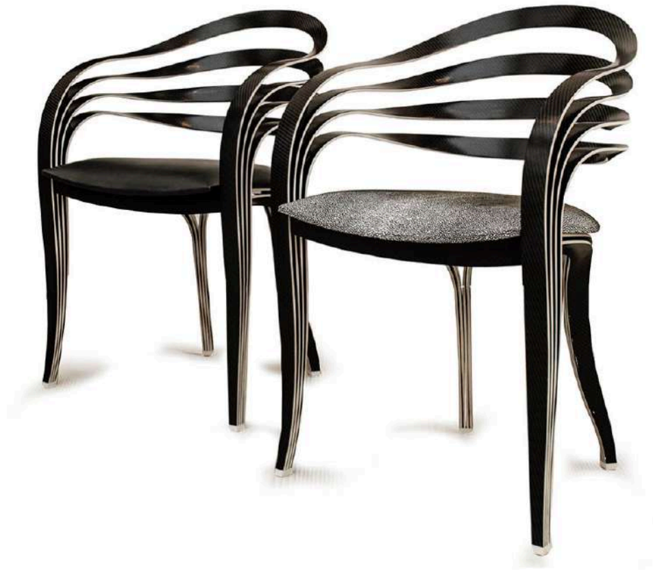
Pierre Renart — Genesis Armchairs, carbon fiber and Corian, 54 x 53 x 80cm, 2011.