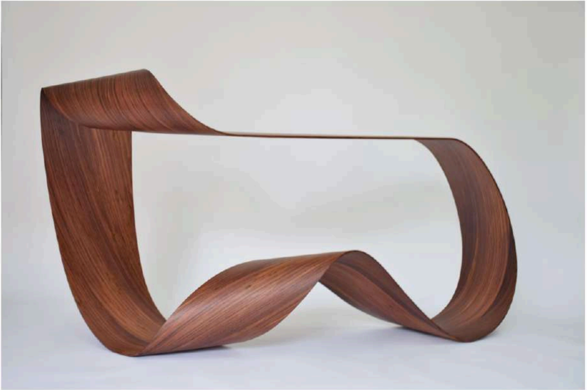
Pierre Renart — Möbius console, American walnut, 190 x 90 x 75 cm.

Pierre Renart's Ribbon Collection was inspired by the works of German mathematician August Ferdinand Möbius. First piece from the collection as well as Pierre Renart's signature piece, the Möbius console reinvents Möbius's ribbon — which is a compact surface with a single side, interior and exterior-less.