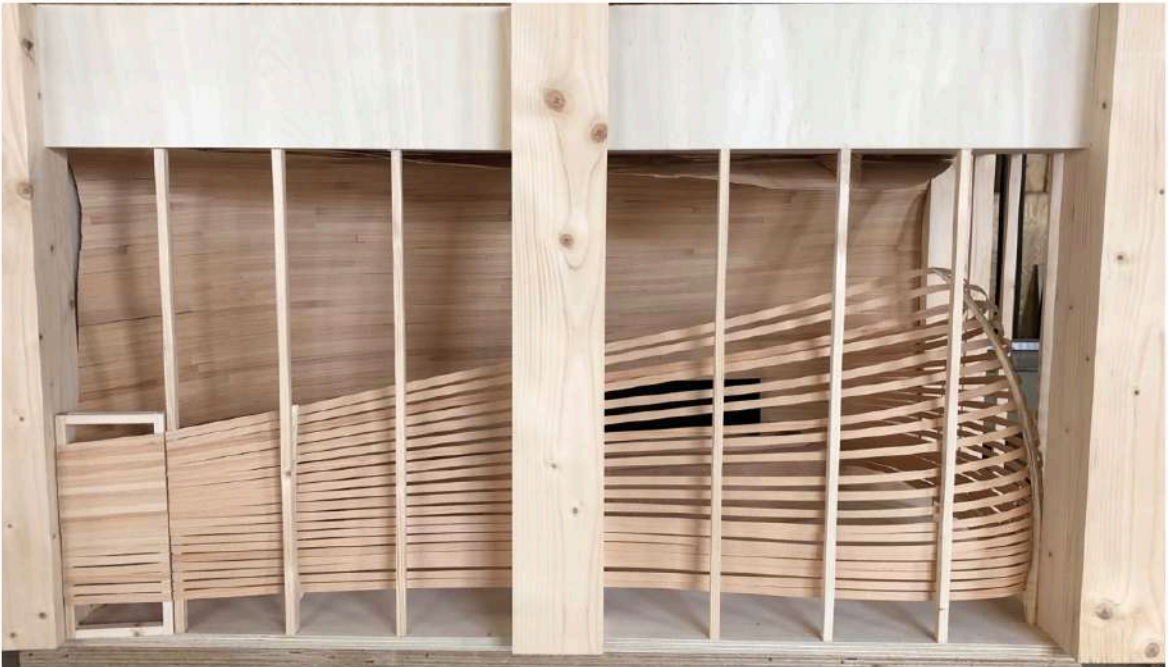
Scale model of the new restaurant, New York