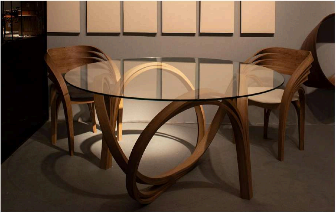
Pierre Renart – Ecllosion Dining Table, American walnut and glass tabletop, D140 x H75 cm. Pierre Renart – Genesis Armchair in wood, oak and leather, 53 x 54 x 80 cm.