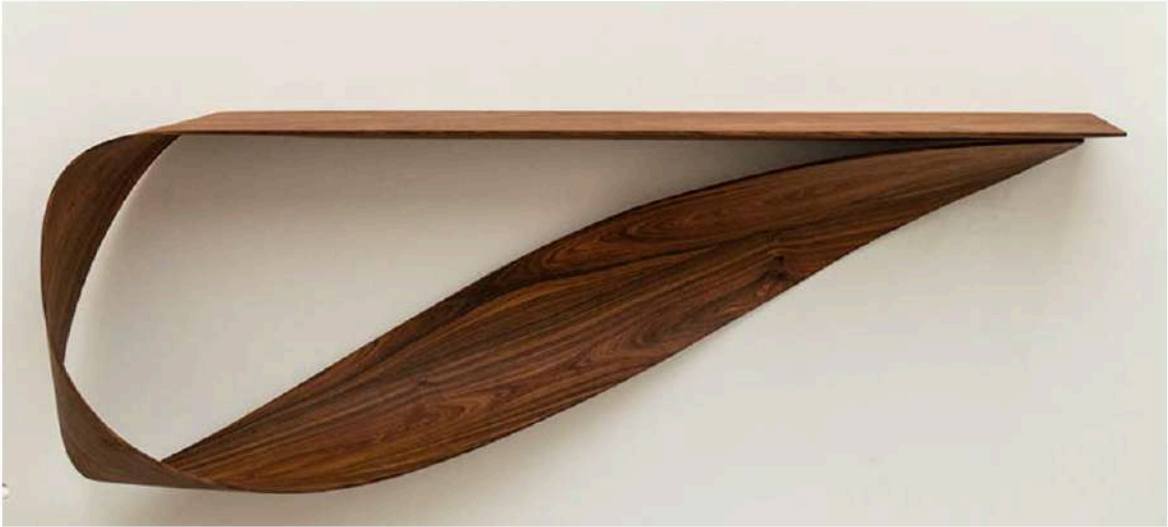
Pierre Renart – Wave wall console, rosewood, 145 x 45 x 75 cm.

Second signature piece from the Ribbon Collection, the Wave desk seems to defy the laws of gravity as it takes on the form of a wood wave, flexible and yet frozen into an elegant curve. The desk was inspired by the movement of the waves on Hawaii's renowned beaches.