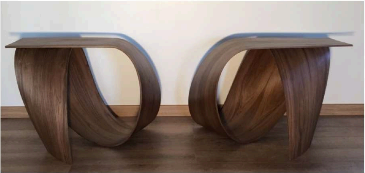
Pierre Renart – Wave Side Table, American walnut, 78 x 60 x 54 cm.