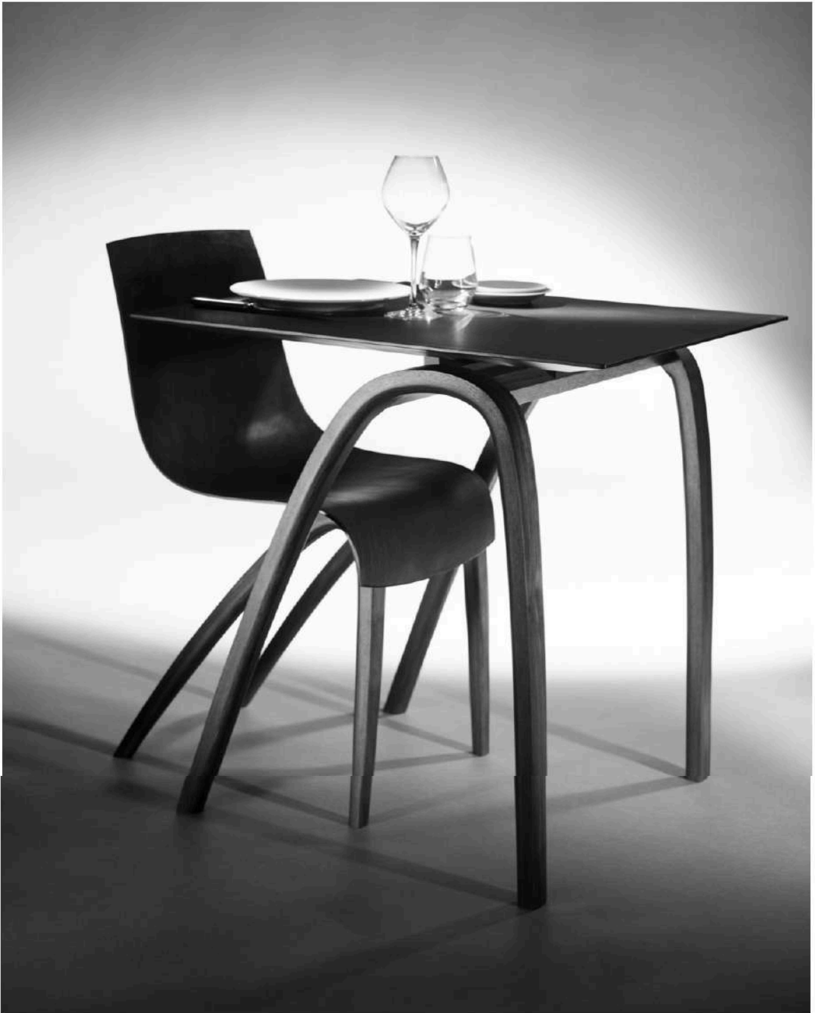
Pierre Renart — Harcourt Armchair, American walnut, carbon fiber, anthracite leather, 56 x 60 x 87 cm, 2016 and Harcourt Table, American walnut and carbon fiber, 75 x 60 x 72 cm.