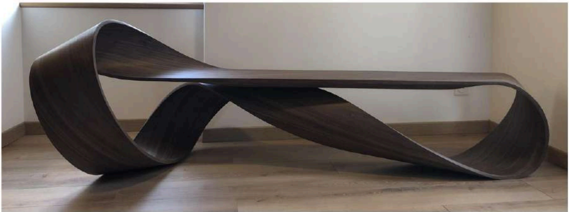
Pierre Renart — Möbius Bench, Ribbon Collection — bench, American walnut, 230 x 80 x 72 cm, 2020.

Within the Ribbon collection, the Möbius bench is Pierre Renart's latest artwork. Audaciously seeking upmost elegance in curves, Pierre Renart worked with American Walnut, a noble wood essence whose soft hues magnify the sheer purity of the lines and the beauty of the overall shape which is as surprising as it seems natural.