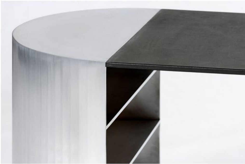
Pool Studio, 'Barrel' desk, 2019 (detail)

The Mobilier National purchased pieces by two designers represented by Galerie Gosserez in Paris: 'Brass' desk (2020) by Valentin Loellmann and a pair of 'Nida' lamps (2019-2020) by Vincent Poujardieu.