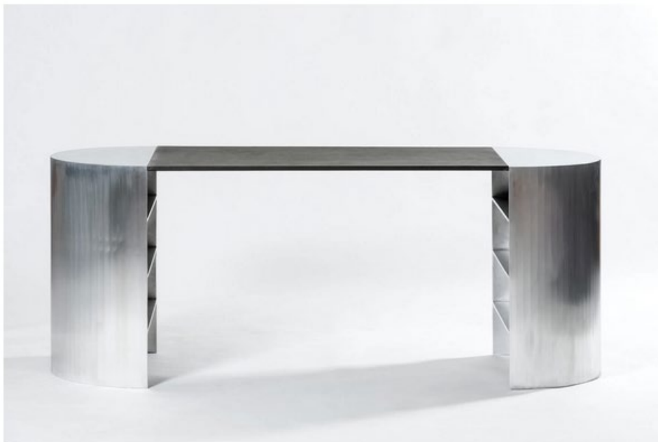
Pool Studio, 'Barrel' desk, 2019