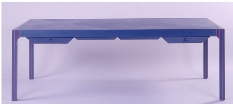
Pierre Paulin, 'Desk' designed for President François Mitterrand, 1985

In 1971, President Georges Pompidou chose Pierre Paulin to furnish his private apartments in the Elysée Palace. Paulin was also selected by President François Mitterrand in 1984 to design a blue lacquered metallic desk with pink aluminium stripes. Other presidents have perused the Mobilier National's collection, or sought advice on which pieces to use for their offices and apartments.