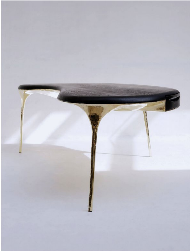
Valentin Loellmann, 'Brass' desk, 2020

Loellmann is a German designer based in Maastricht. His 'Brass' desk, with three brass legs and curvilinear wooden top, was envisioned to break with the standard four-legged archetype. "I try to break all the rules in furniture-making of what's possible and what's allowed," Loellmann, 37, says. "This organic shape changes your habit of how to approach a piece as it's more playful and less restrictive."