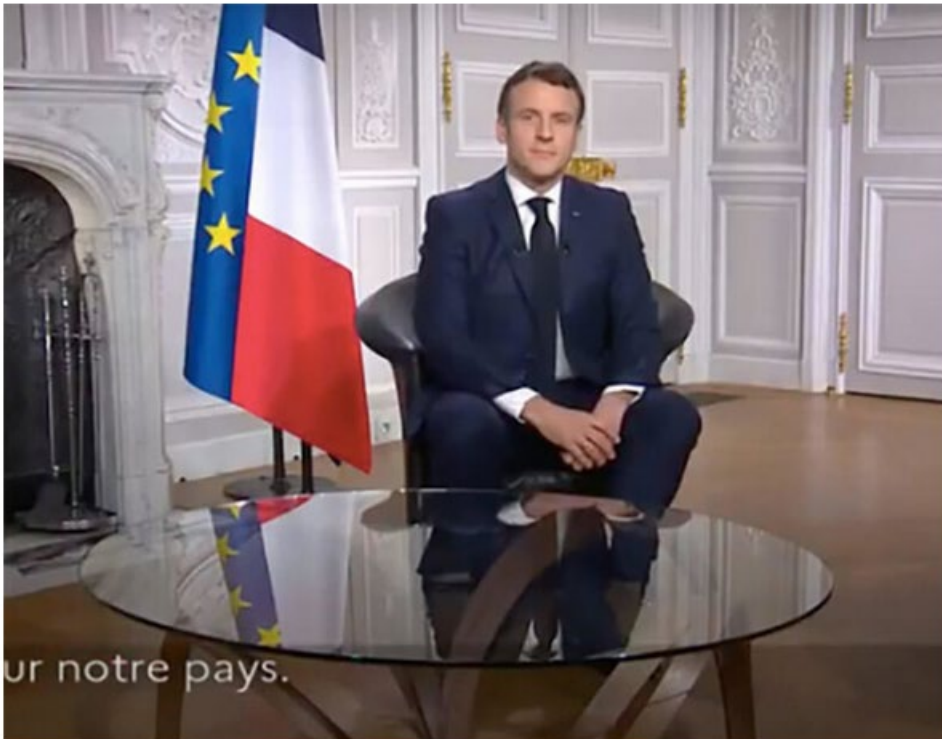
Screenshot from President Emmanuel Macron's new year's address, 2021, with 'Ecllosion' table (2017-2020)