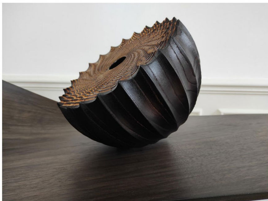
Jérôme Blanc, wood sculpture Arantèle 2020 - ash, D 30 cm, 2020.