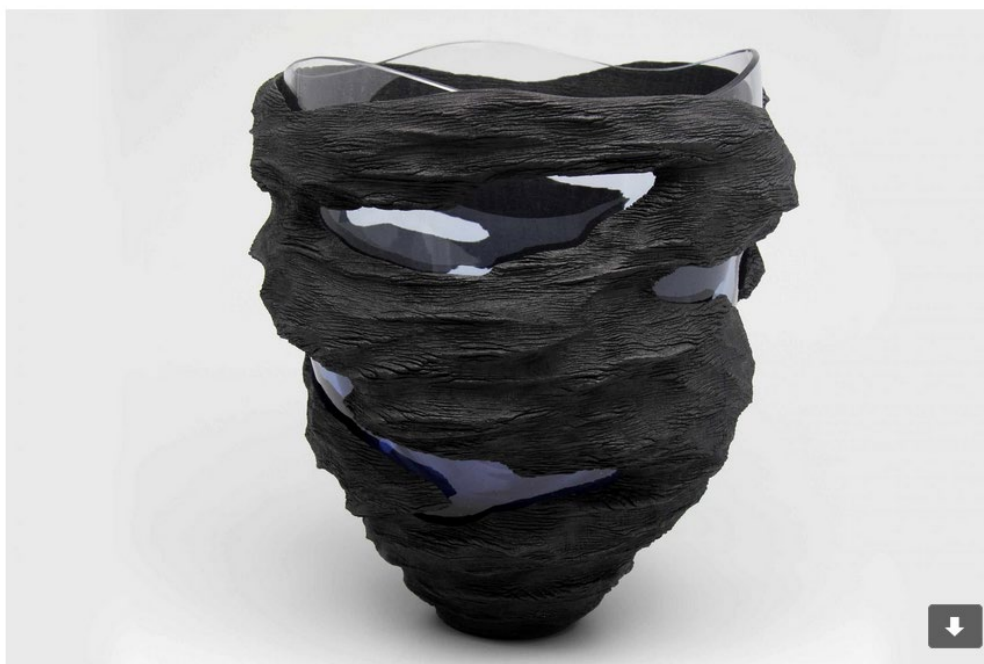
Jérôme Blanc, "Sklo" - walnut, glass, D 20 cm, 2019 - Ariana Museum, Switzerland

Jérôme Blanc's artworks have been acquired by prestigious private collections, as well as by worldwide public institutions such as: