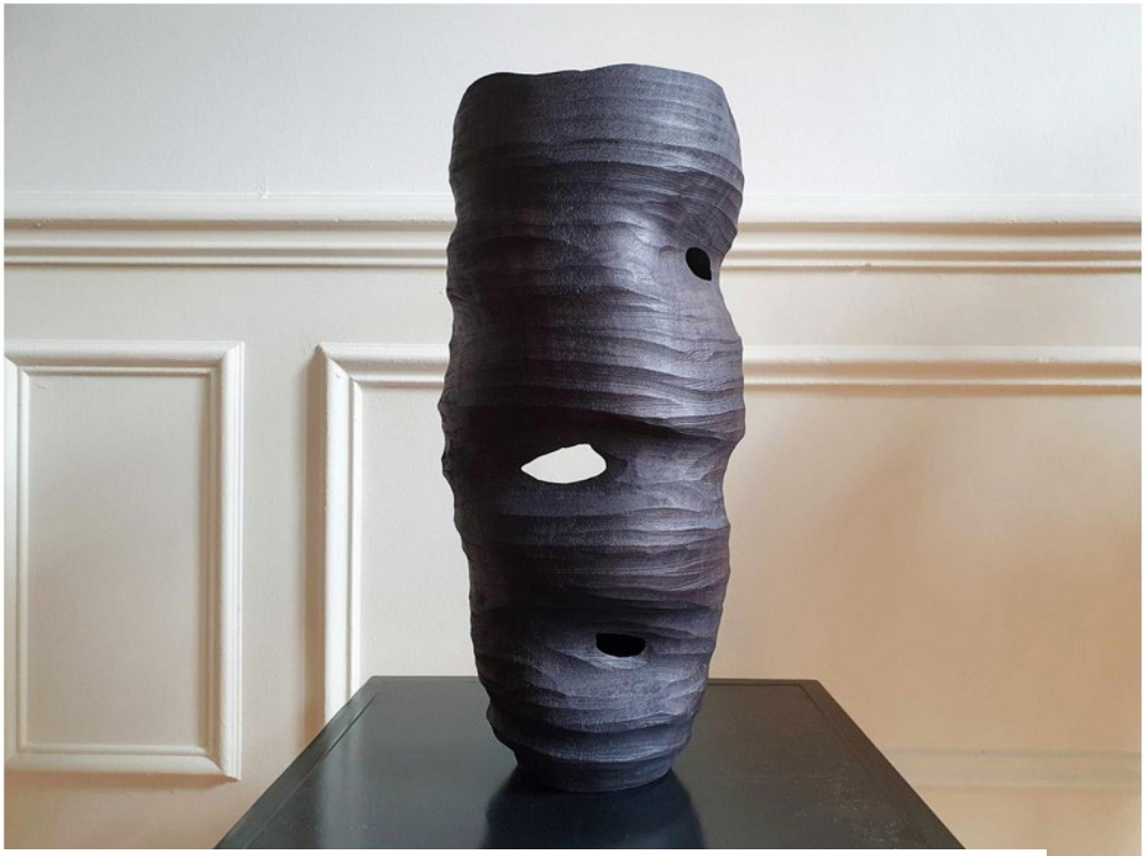
Jérôme Blanc, wood sculpture Terre II - walnut, H 38 x D 18 cm, 2020