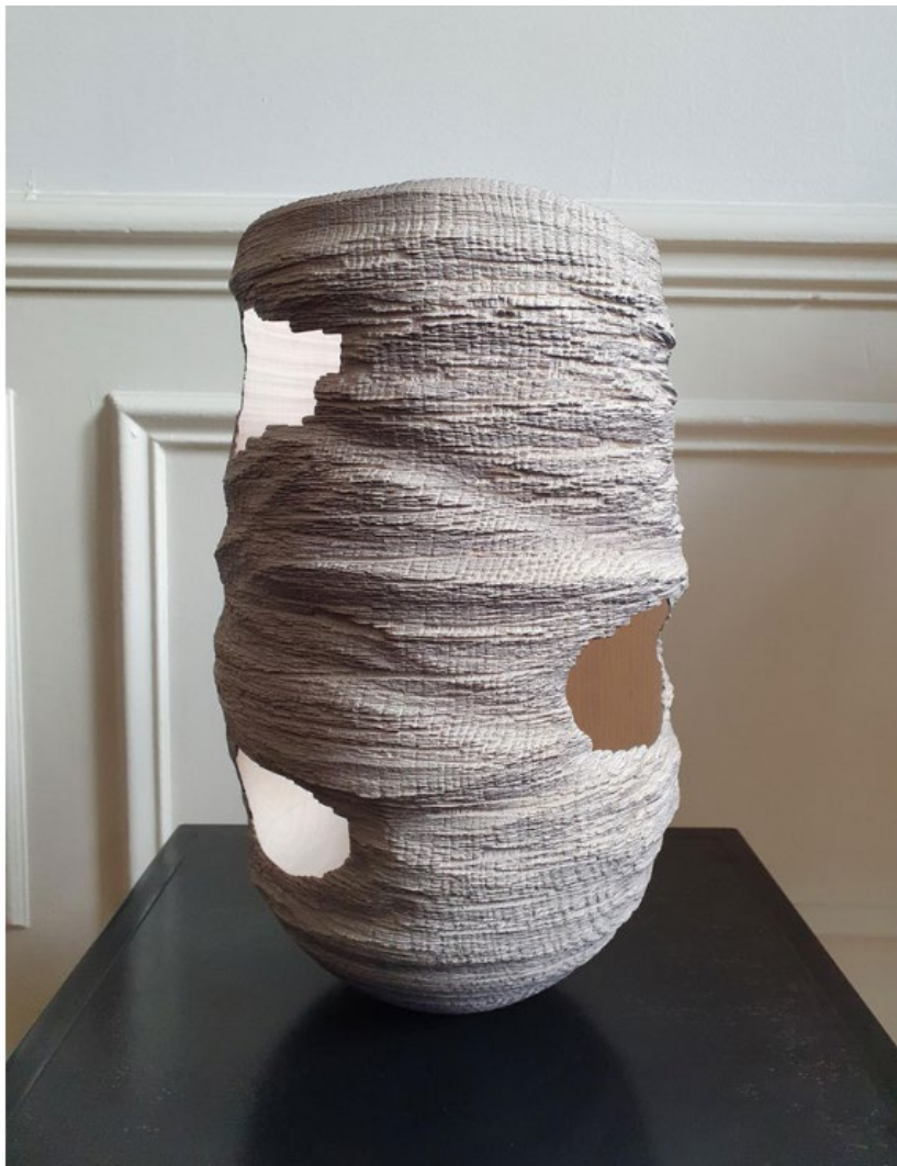
Jérôme Blanc – wood sculpture Terre III - ash, H 33 x D 20 cm, 2020