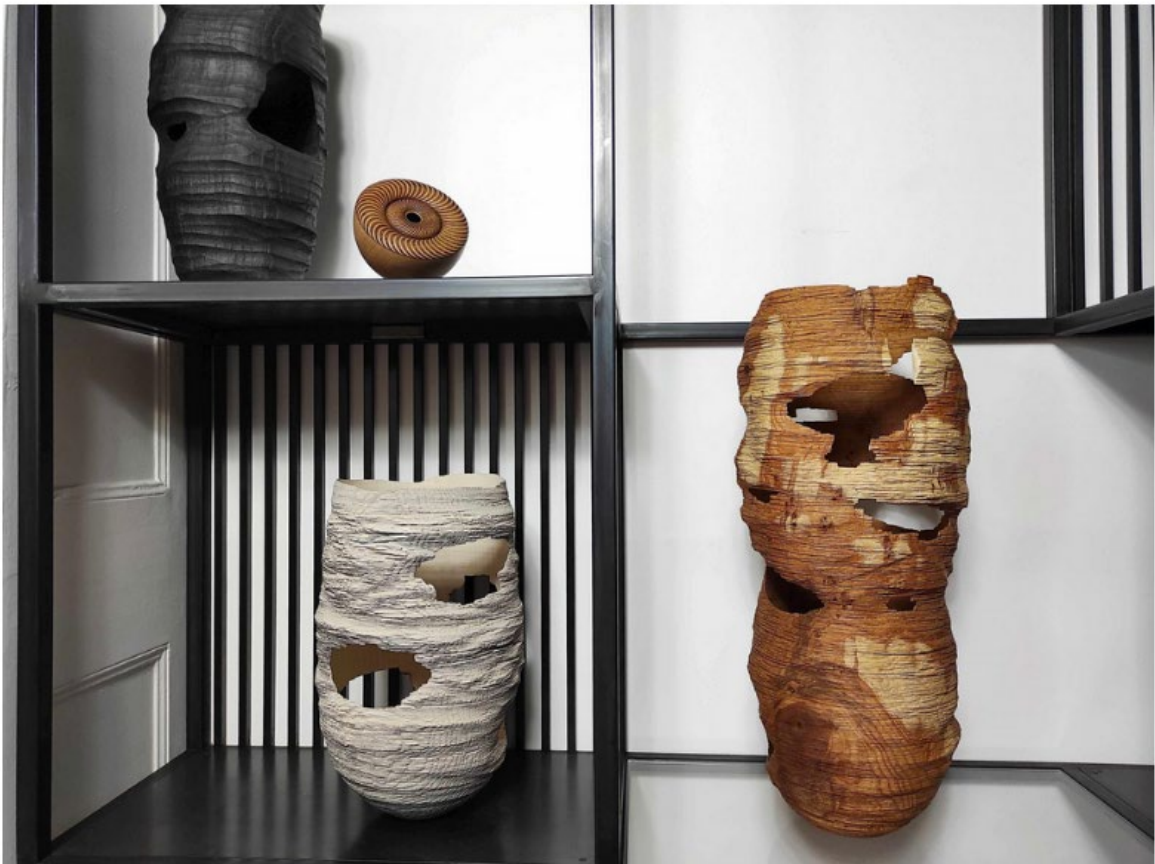
Jérôme Blanc, wood sculptures Terre II (top left) - walnut, H 38 x D 18 cm, 2020; Mola 2020 (top right) - ash, D 12 cm, 2020; Terre III (bottom left) - ash, H 33 x D 20 cm, 2020; Terre I (bottom right) - yew, H 51 x D 20 cm, 2020.