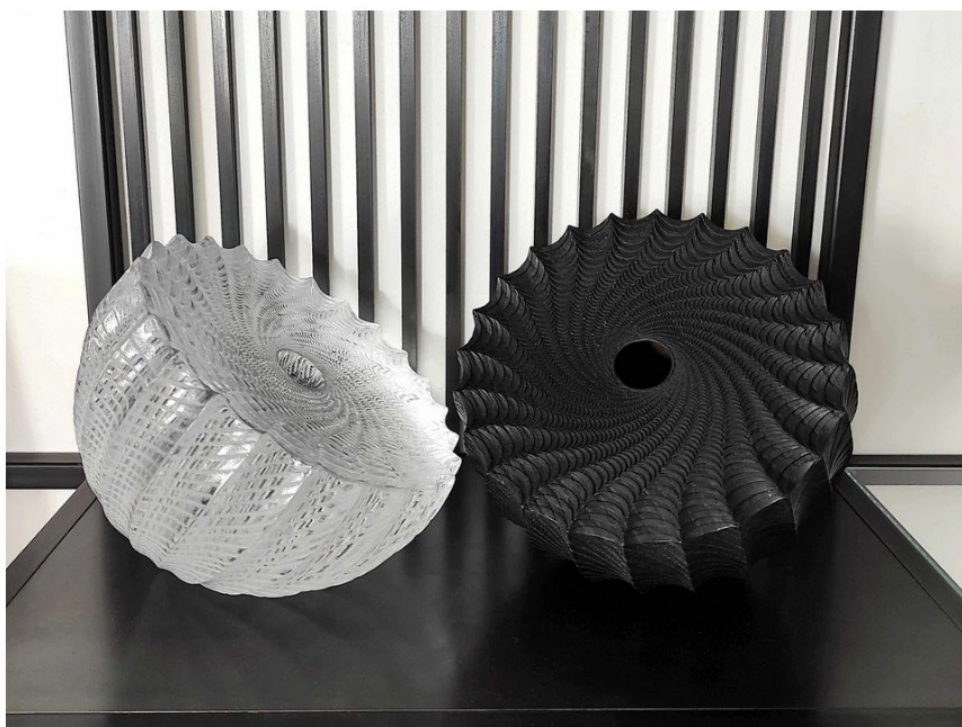
Jérôme Blanc, sculptures Arantèle II Verre (left) - glass, D 30 cm, 2020 - limited edition of 8, 2/8 ; Arantèle II Bronze (right) - bronze, D 30 cm, 2020.

For his emblematic Arantèle Series , made of unique pieces made in a variety of wood essences like ash, yew or walnut, our talented woodturner has worked with a master glassmaker and a master bronze-smith, to create limited editions of 8 in glass and in bronze, translated in those two materials the turned wood of the Arantèle Collection.