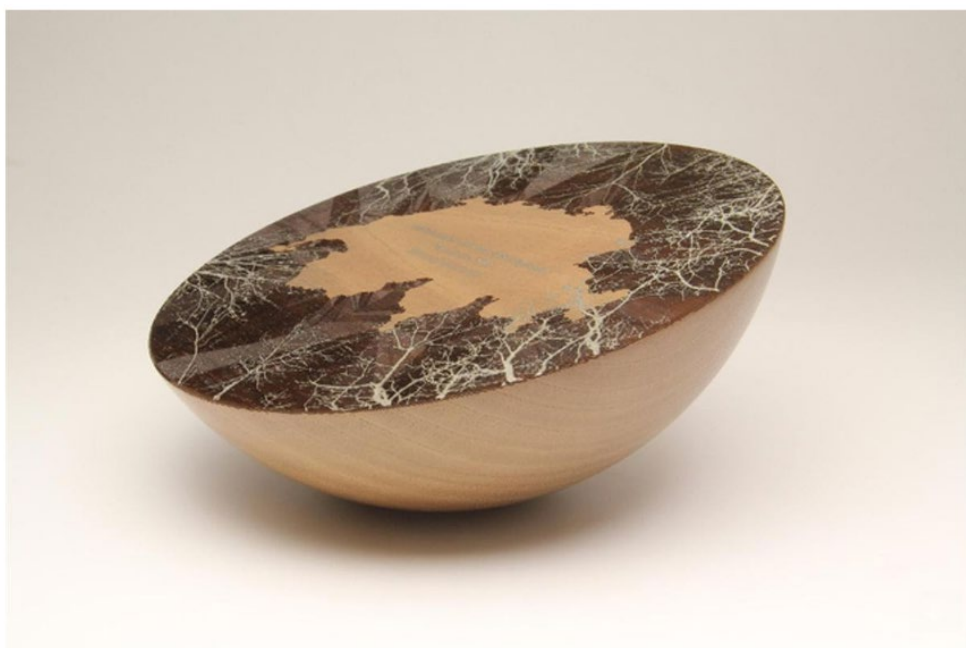
Trophy of the Arts and Crafts prizes, Geneva, Switzerland