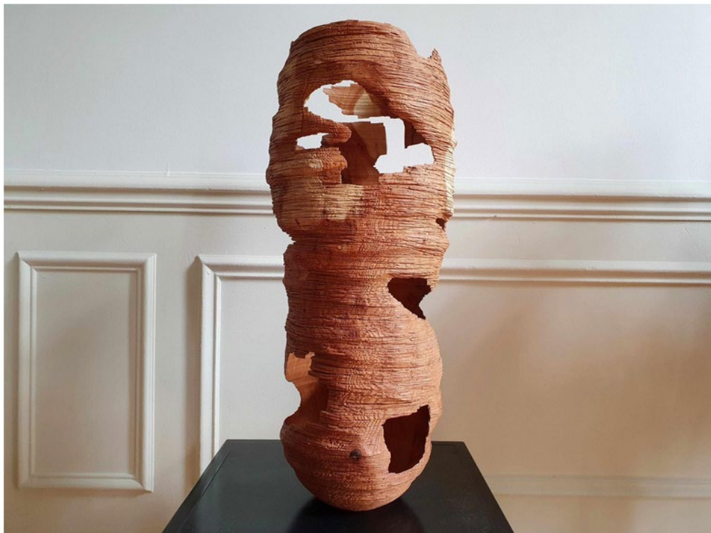
Jérôme Blanc, wood sculpture Terre I - yew, H 51 x D 20 cm, 2020