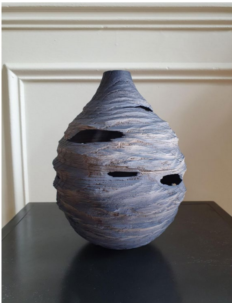
Jérôme Blanc, wood sculpture Terre X - ash, H 21 x D 17 cm, 2020.