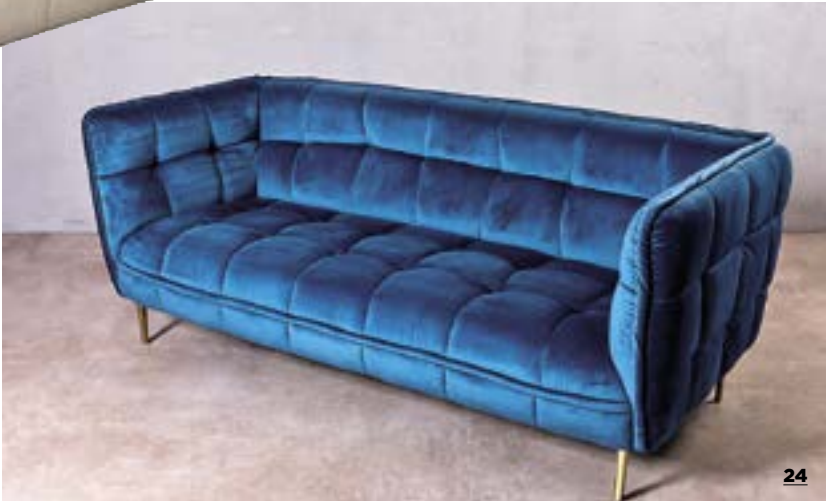
22. Cloud sofa from www.phcollection.be .