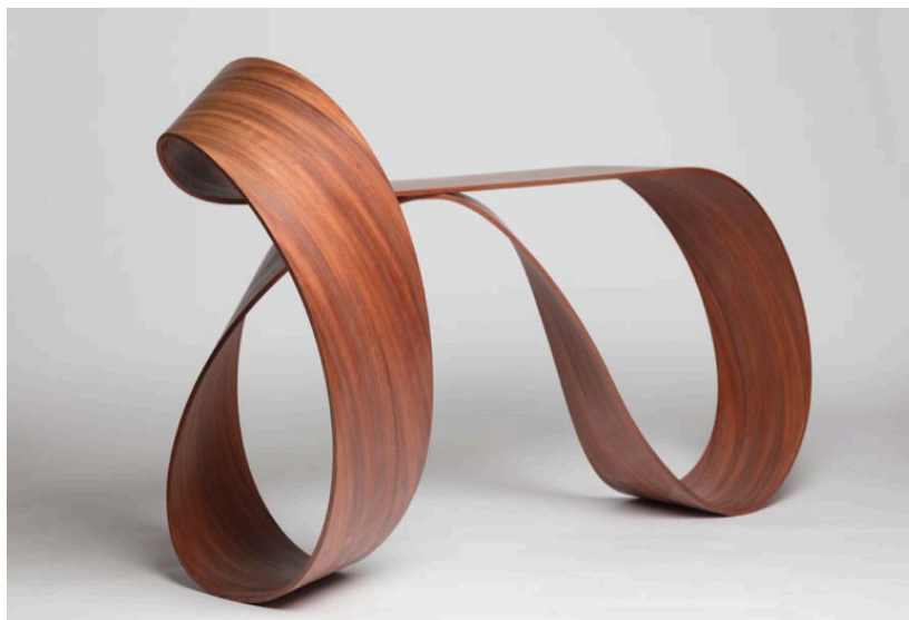
Console Mobius en Padouk By Pierre Renart Courtesy of Pierre Renart and Maison Parisienne Image credit: Francois Roelants, 2020