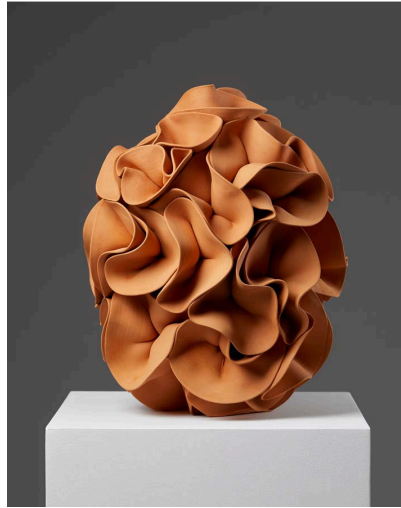
Ceramic sculpture "Hybrid" by Alvina Jakobsson