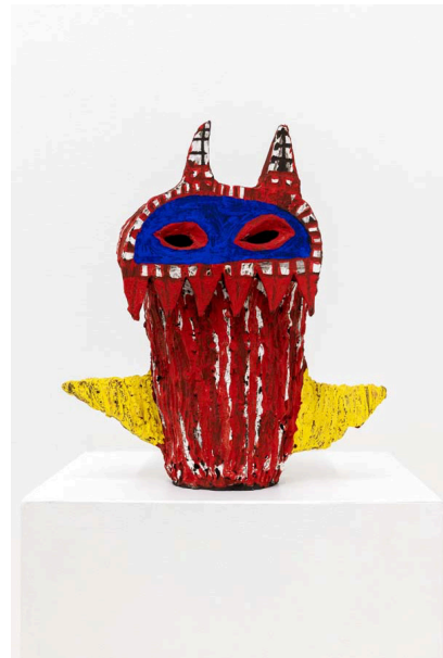
Devil by Timothée Humbert