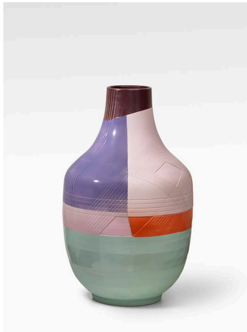
Facet Bottle – Day By Hella Jongerius