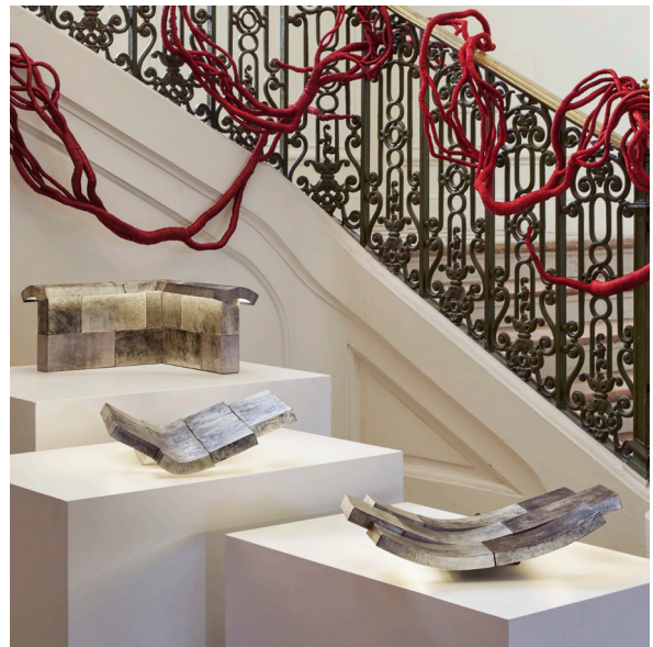
Pas à pas - 15 years, 15 artists, 15 works, 2023