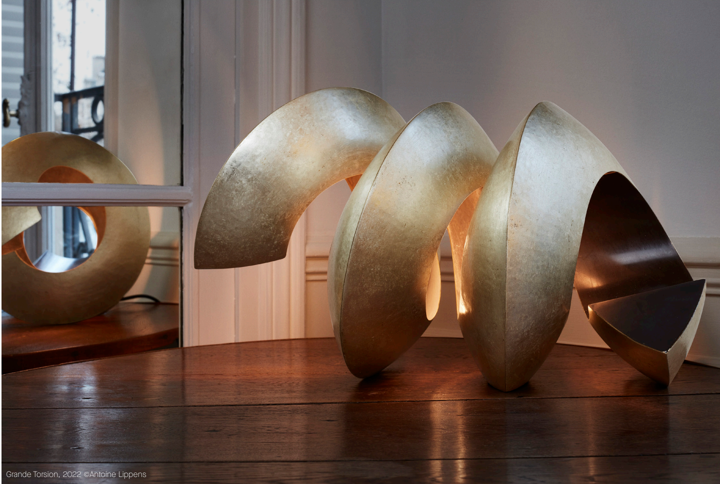
Grande Torsion, 2022