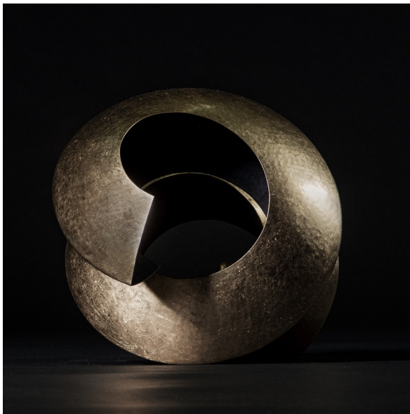
Torsion Or, 2021 - Mobilier national

New creations by Hervé Wahlen are proudly showcased on maison parisienne's stand at PAD Paris and PAD London each year. The artist was also selected by the gallery to participate in its anniversary exhibition, "15 years, 15 artists, 15 works," in April 2024. He created a set of 3 luminous sculptures called Pas à pas , which combines the angular shape of the red bricks from Picardy - where his studio is located - with the curves and distortions characteristic of his work.