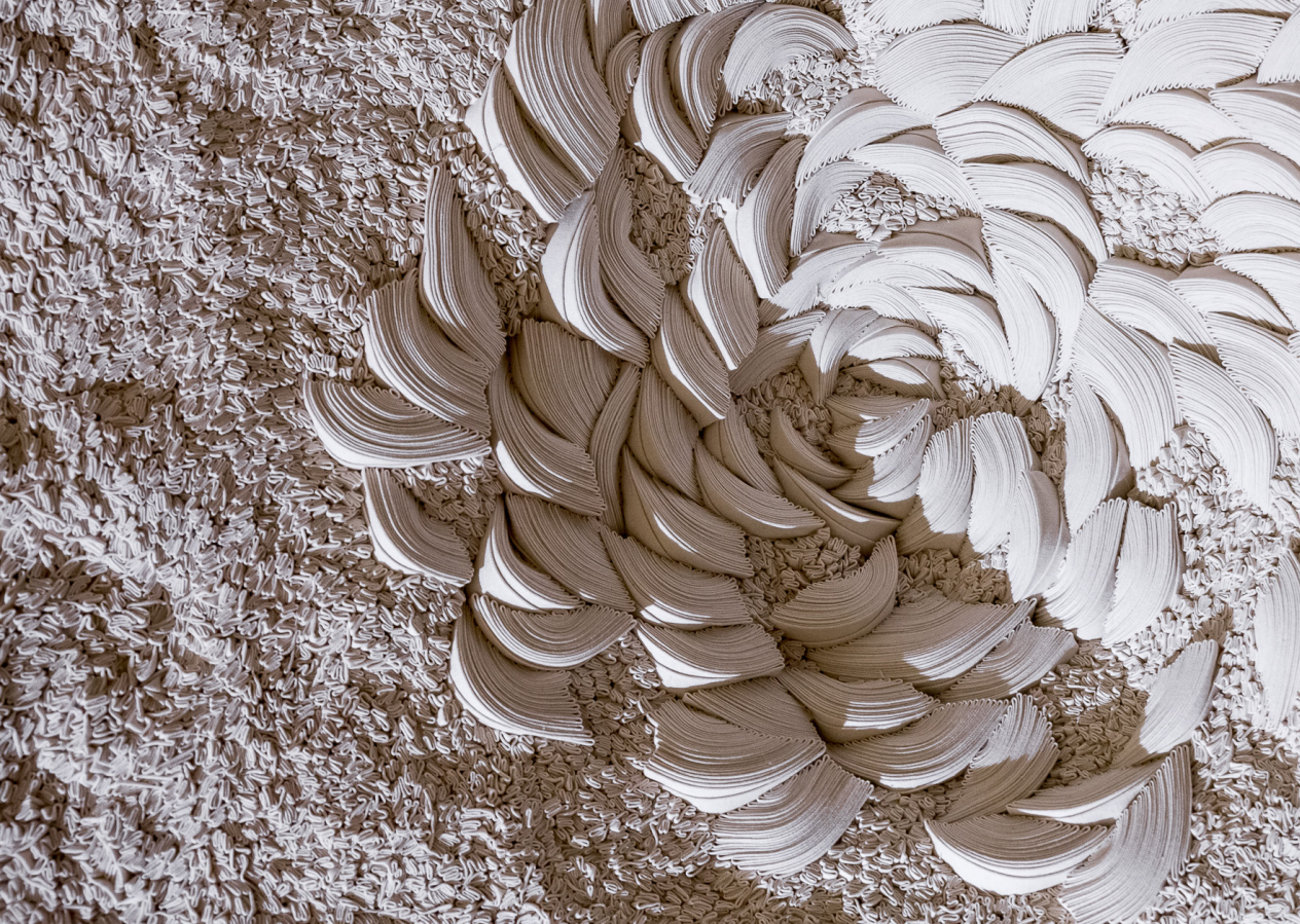
Écllosion XXL, 2017 © maison parisienne