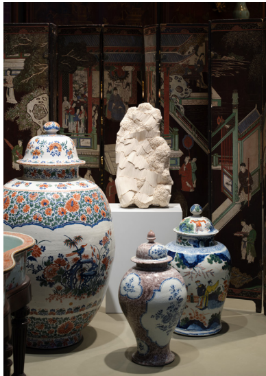
Exposition Pleuse de Temps, 2022 - MAD Paris