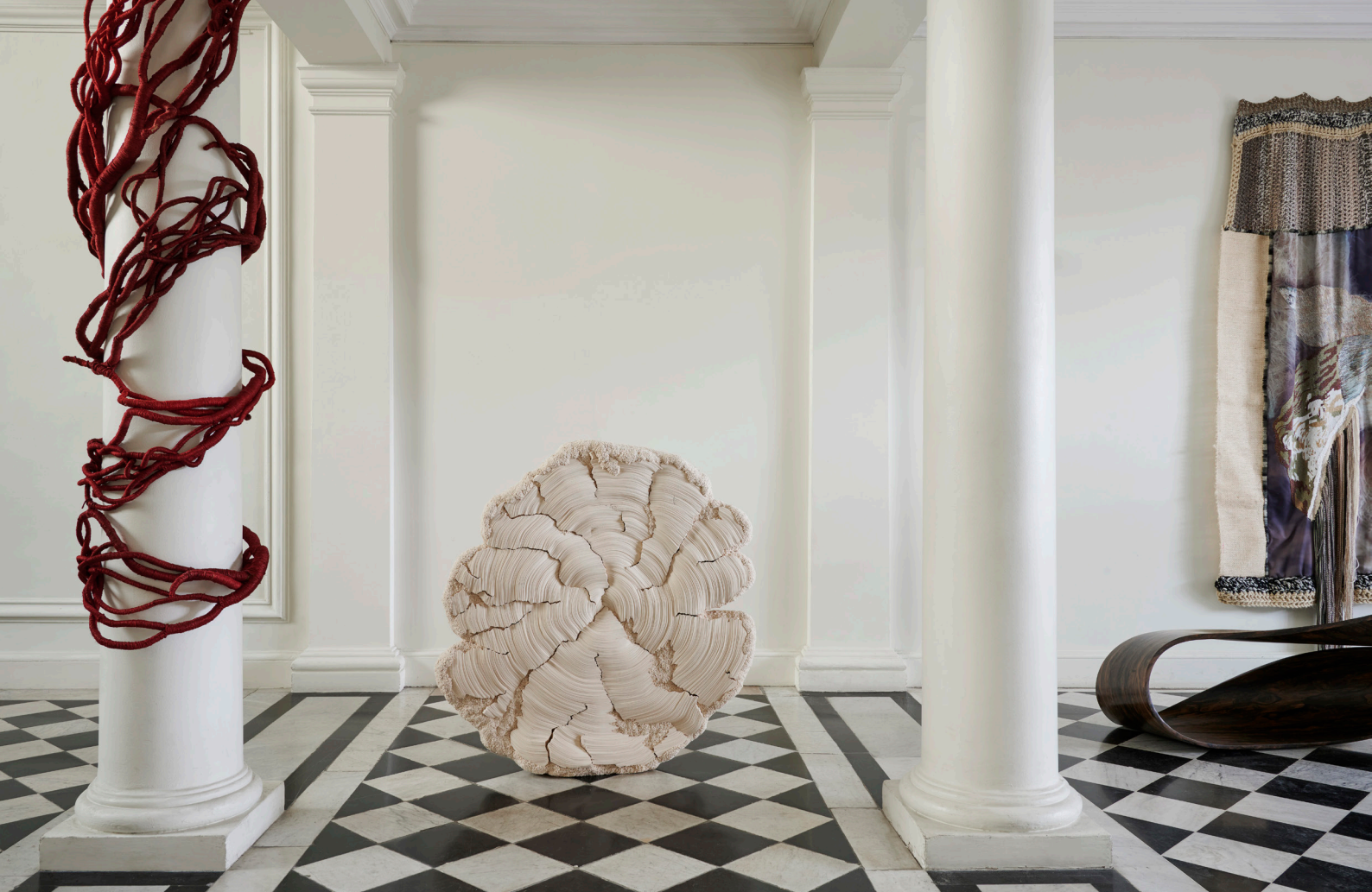
L'intemporelle - 15 years, 15 artists, 15 works, 2023 © maison parisienne