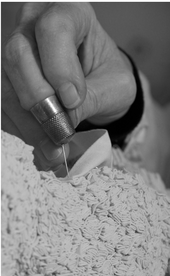
Simone Pheulpin