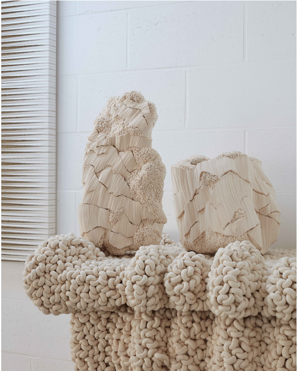
Falaise I, 2012 et Anfractuosité I, 2013 ©Antoine Lippens