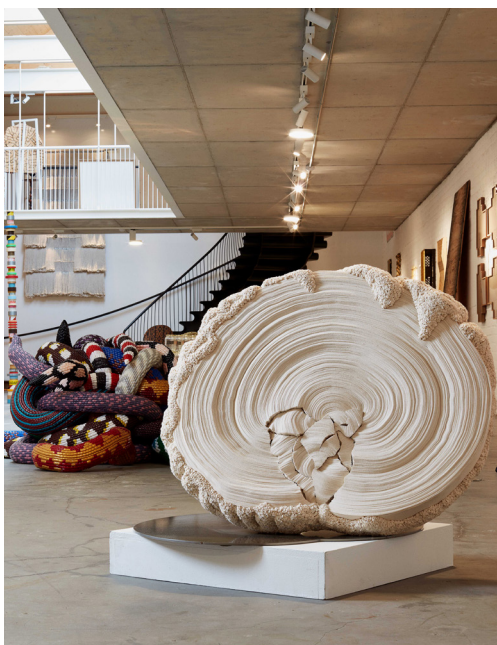
Croissance I, 2007 © Antoine Lippens

Several works are held in the permanent collections of the Victoria & Albert Museum in London (Eclipse XII), the Art Institute of Chicago (Strates IV), the Mobilier National and the Musée des Arts Décoratifs in Paris (Jérôme, Écllosion Épingles and Détail VII). The latter devoted a solo exhibition to the artist to mark her 80th birthday, bringing together some fifty pieces. This exhibition saw the publication of the artist's monograph by Cercle d'Art, which was reissued in 2022.