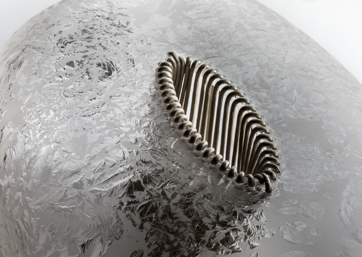
Gérald Vatrín, Météora Blanche , 2022 ©maison parisienne