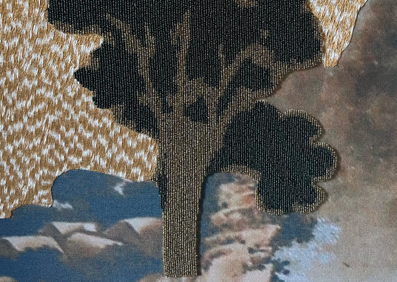
Aurélie Mathigot, Voyage réjouissant , 2022