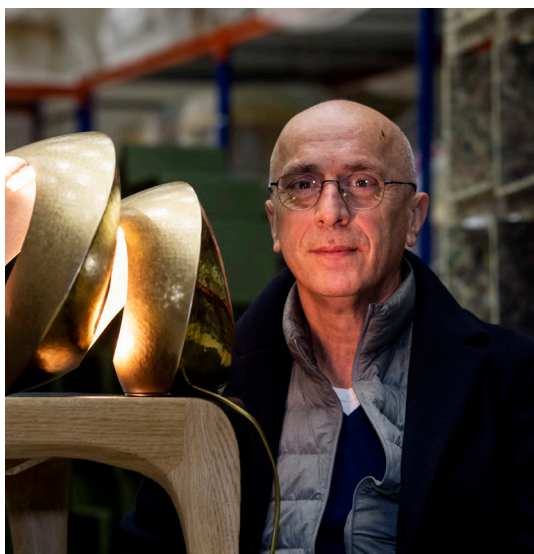
Hervé Wahlen