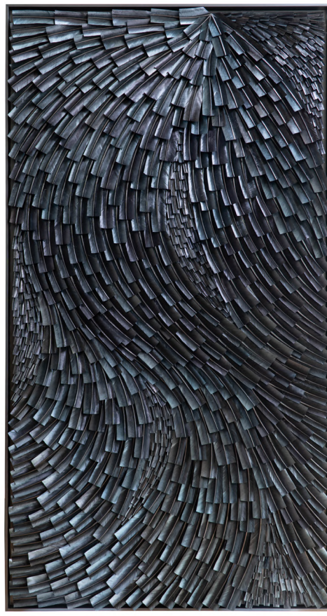
Julien Vermeulen, Black Stone VII and VIII (Dptych) , 2022, ©maison Vermeulen