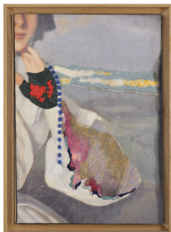
Aurélie Mathigot, Sans ta beauté je suis perdue , 2022, Musée des Arts Décoratifs, Paris

maison parisienne has represented Aurélie Mathigot since 2009.