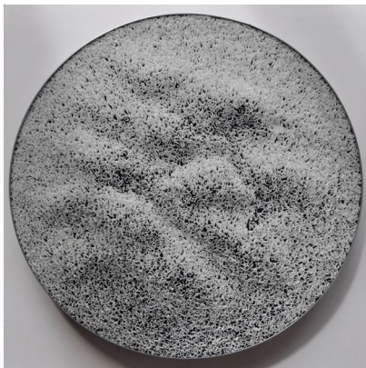
Coralie Laverdet, Luna I , 2020 ©maison parisienne