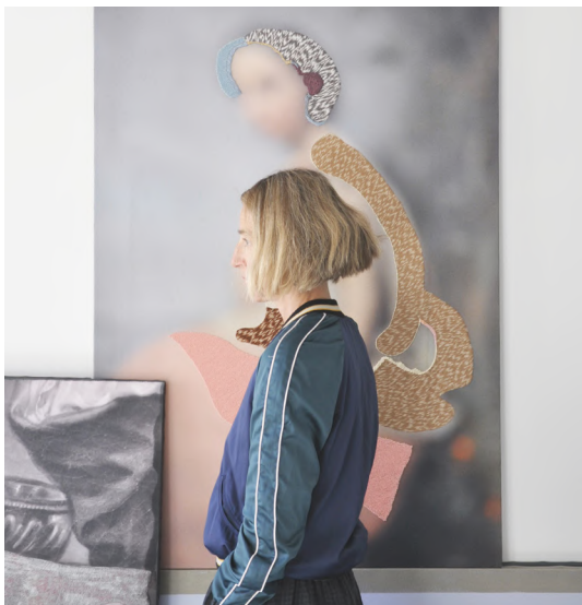
Aurélie Mathigot © maison parisienne