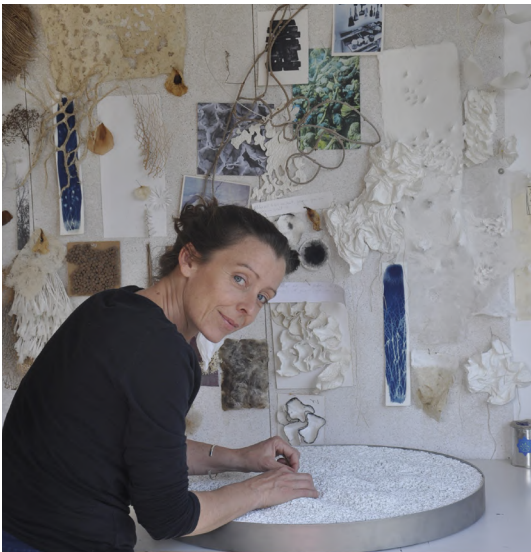
Coralie Laverdet © maison parisienne