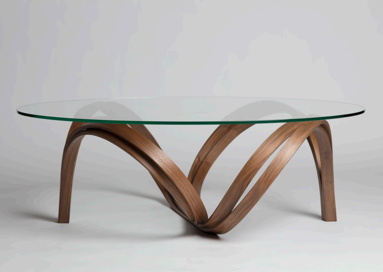
Pierre Renart, Écllosion coffee table , Genèse collection, 2020, Mobilier National