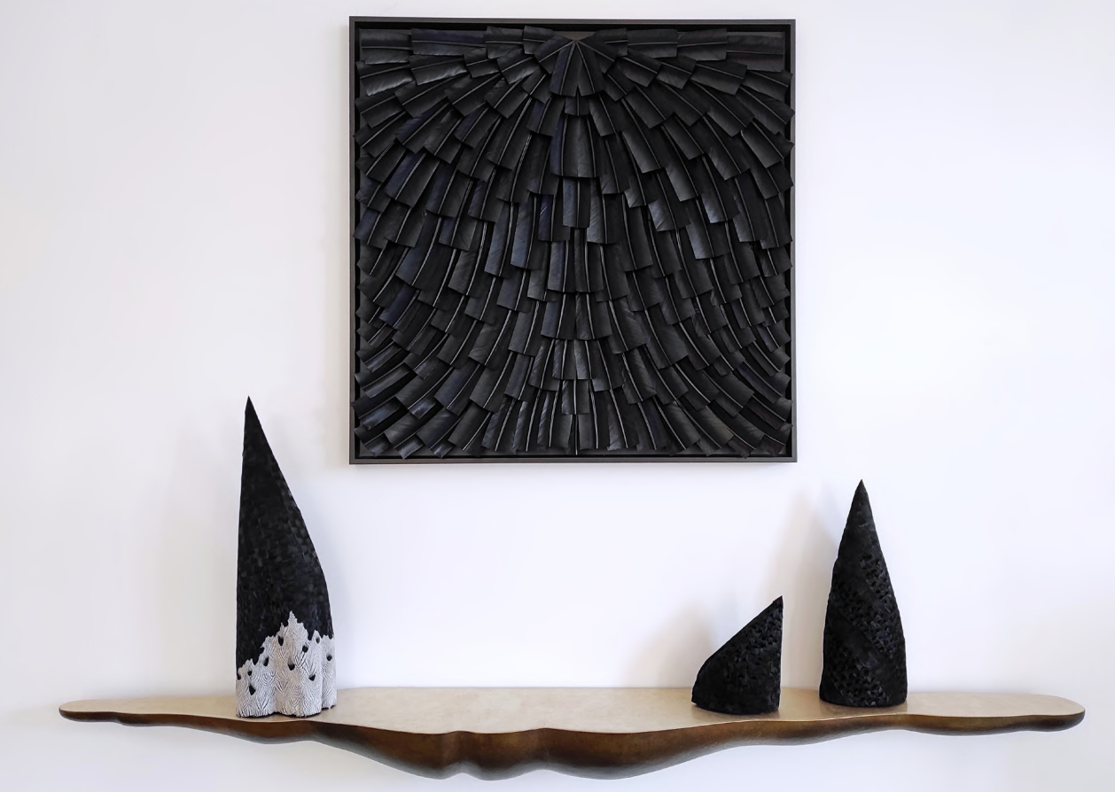
Hervé Wahlen, Console serie Relief I , 2020 © maison parisienne