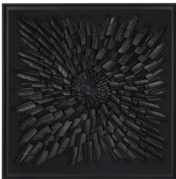
Julien Vermeulen, Black Gem , 2020, Musée des Arts Décoratifs, Paris

Whether burnt, curled, coloured or glued, the peacock, ostrich, goose or pheasant feathers stimulate the imagination. The artist’s creations are inspired by the spectacular, the feather becoming a painting, a wall panel, decorative element or sculpture. From 2017 to 2021, the artwork Black Ocean composed of nearly 12,000 feathers is exhibited at the Palais de Tokyo in Paris. In 2021, Black Gem entered the permanent collections of MAD Paris. In 2022, the Mobilier National acquired one of his creations for the exhibition Les Aliénés .