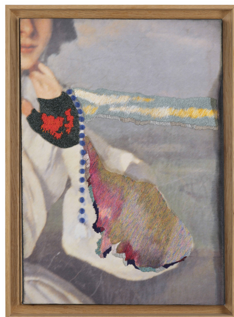
Sans ta beauté je suis perdue, 2021 ©Christophe Dellié

This work is part of the series, Photos Volées , composed of photographs that capture the details of museum paintings, then overlaid with embroidery and large pearls.