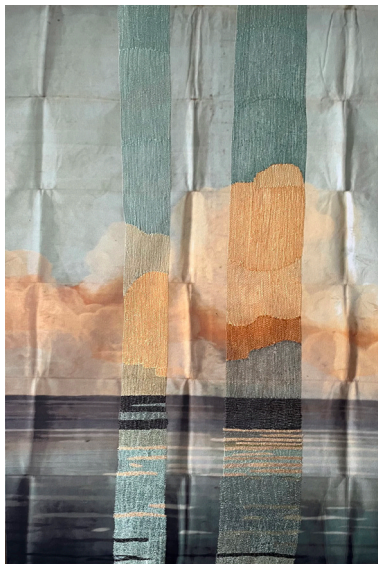
Plage #1, 2022