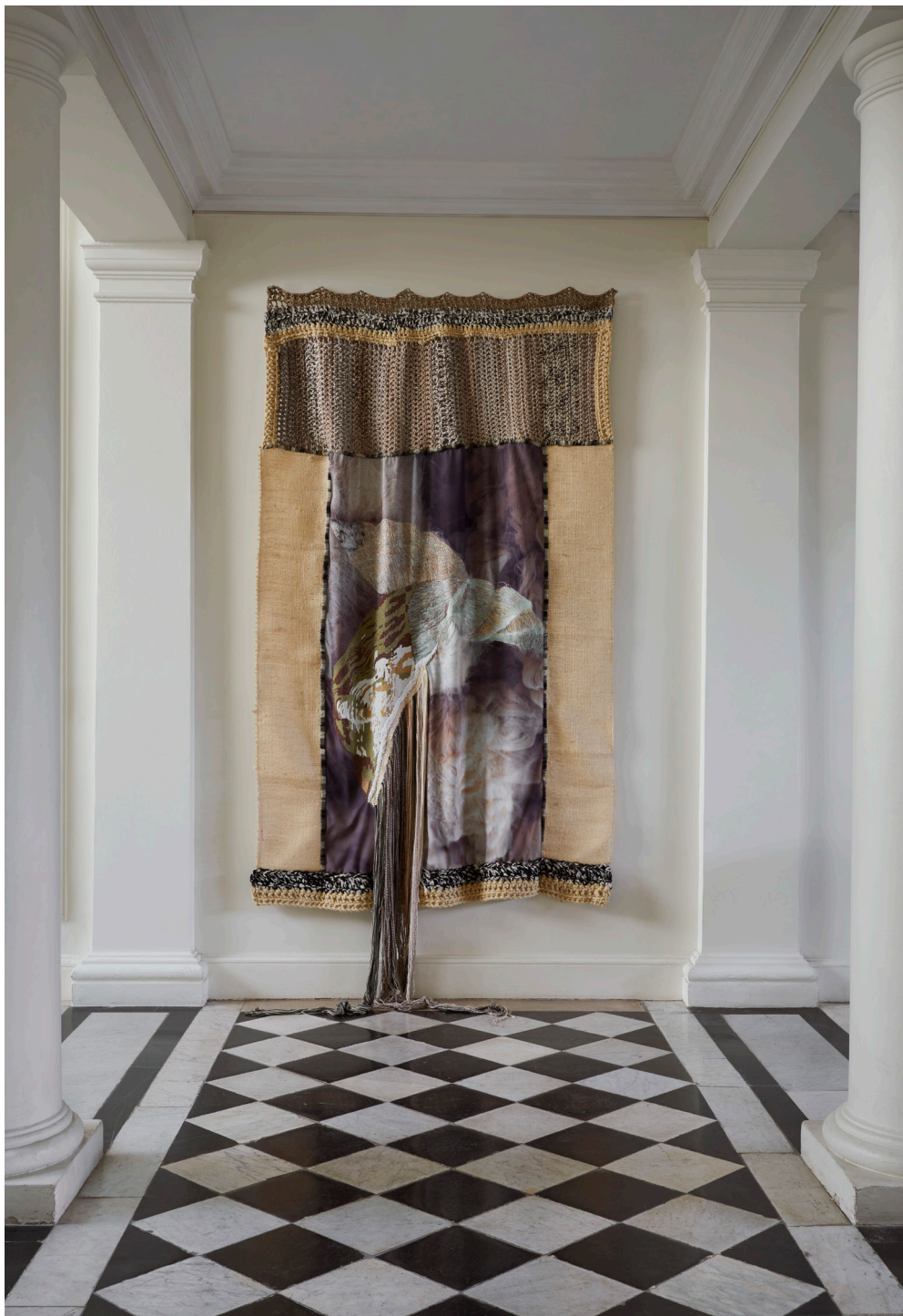
Hommage à Calais - 15 years, 15 artists, 15 works, 2023