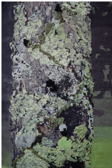
Protect me, 2022