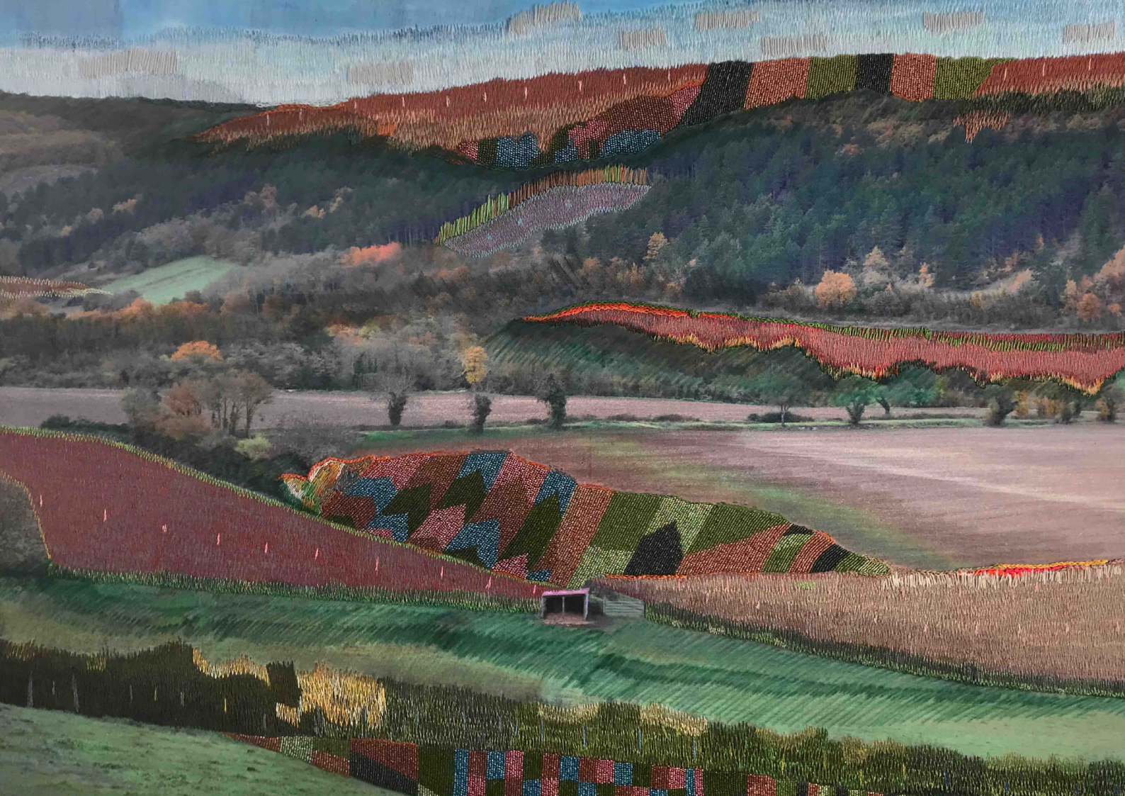
Au pied de la colline sacrée, 2020 ©Eugène Leroux