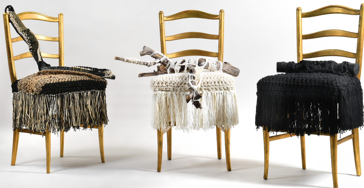
Les Inséparables - Les Aliénés, 2023 - Mobilier National ©Isabelle Bideau

In autumn 2023, the artist participated in the “Les Aliénés” exhibition at the Mobilier National by offering a new interpretation of old chairs covered with a unique crocheted creation. Named “Les Inséparables”, the trilogy transforms pieces of furniture into true collectible objects.