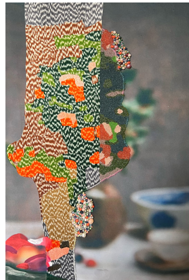
Chaque jour est mon infini, 2022 ©maison parisienne