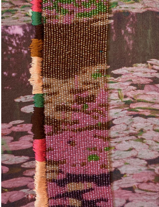
Rêverie A, 2022 ©maison parisienne