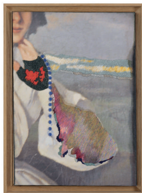
Aurélié Mathigot, Sans ta beauté je suis perdue , 2021

This work is part of the series, Photos Volées ( Stolen Photos ), composed of photographs that capture the details of museum paintings, then overlaid with embroidery and large pearls.