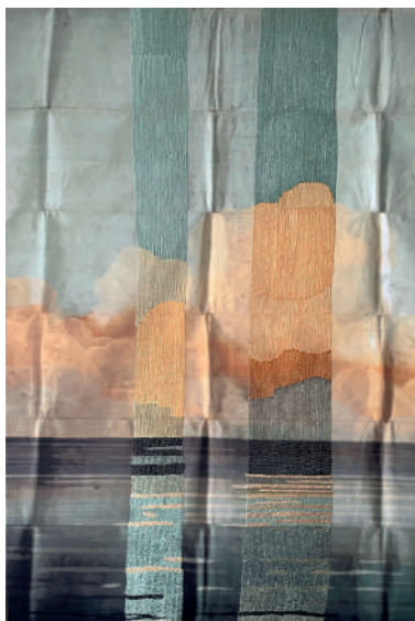
Aurélie Mathigot, Pliage #1 , 2022 © maison parisienne