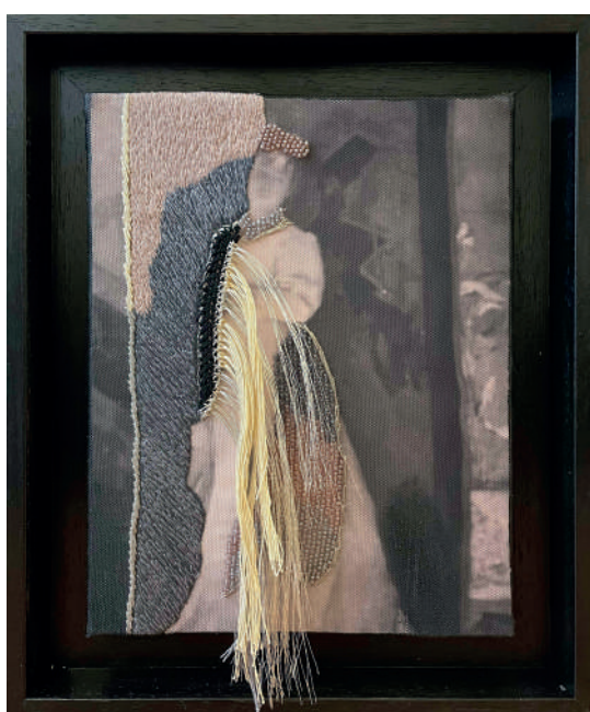
Aurélie Mathigot, Photo Volée 36, 2022

Aurélie Mathigot appreciates working with embroidery because it offers her the possibility to transform the canvas without compromising it. This unique reimagining of form gives timelessness to each work.