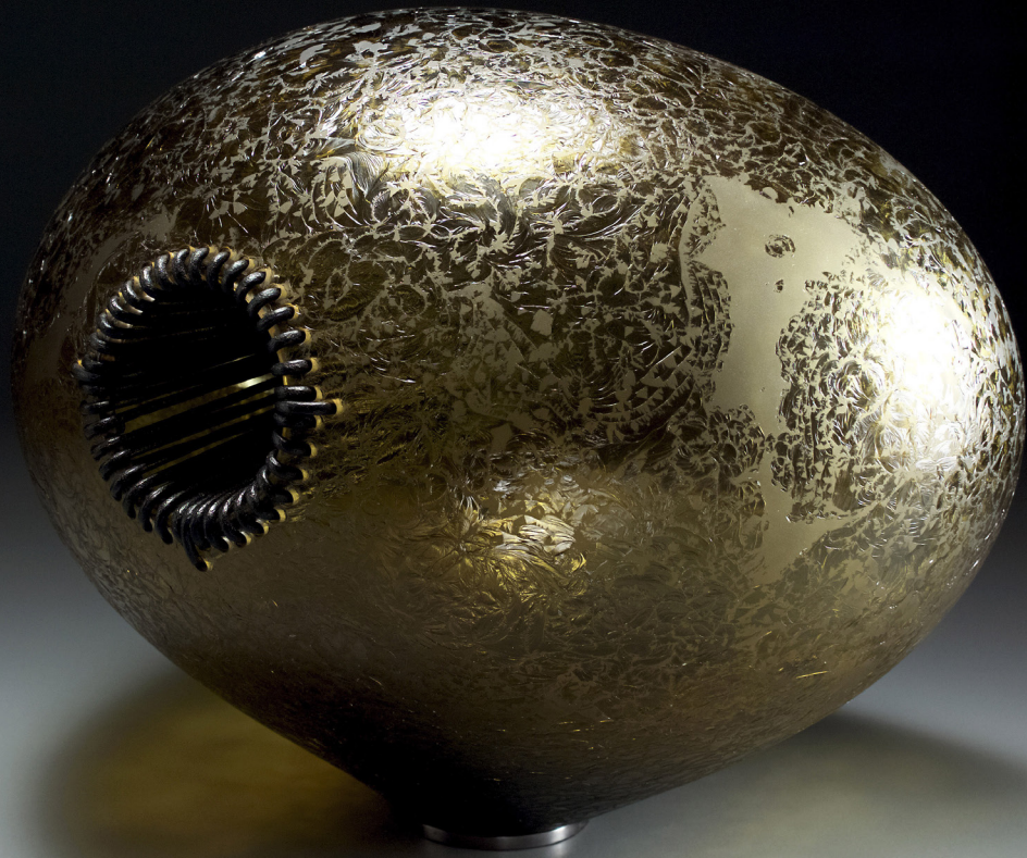
Trait d'union I, 2018, MAD - Musée des Arts Décoratifs Paris ©Amadou Traoré