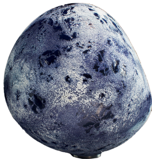
Le Verre vu du ciel XII, 2021

His work is featured in numerous public institutions - including the Musée des Arts Décoratifs (MAD) in Paris, the Musée du Verre de Sars-Potterie in France, the Victoria and Albert Museum in London and the Dutch National Glass Museum in Leedam in the Netherlands - as well as in several private collections, such as the Ernsting Foundation Alter Hof Herding in Germany.