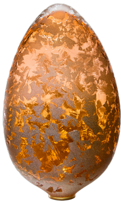
Cristal II, 2022 ©maison parisienne