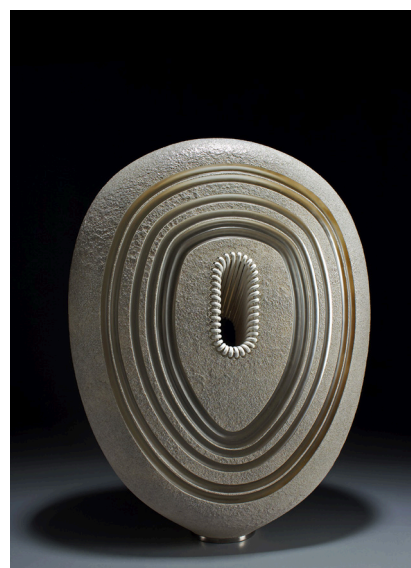
Sable, 2021

New creations by Gérald Vatrin are proudly showcased on maison parisienne 's stand at PAD Paris and PAD London each year. The artist was also selected by the gallery to participate in its anniversary exhibition, "15 years, 15 artists, 15 works", in April 2024. There, he presented Au-delà des apparences , an exceptional set of 5 blown glass pieces enhanced with gold leaf.