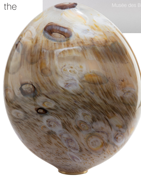
Variations Picturales I, 2023

All unique, the multi-textured sculptures reveal a play of light and shadow, of gloss and matt. Some have the appearance of ice, others of lava stone. As a result of the fusion of cultural influences on several levels, the works convey feelings of calm, agitation, power or restraint.