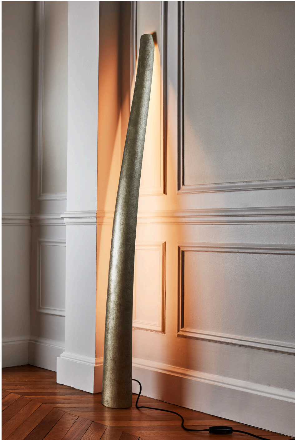
Hervé Wahlen, Ambiance II, 2022 © Antoine Lippens