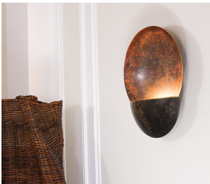
Hervé Wahlen, Genèse, 2020

Endeavouring to experiment beyond the boundaries of art and design, the craftsman has created several lighting collections. Both sculptural and functional, the luminaires are entirely unique, handcrafted pieces.