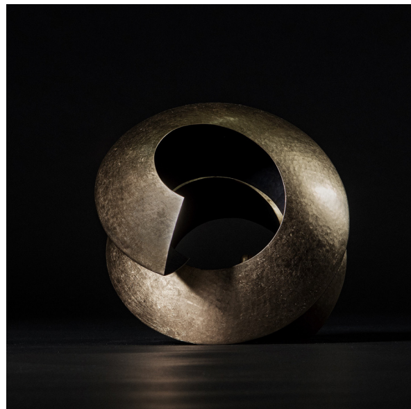
Hervé Wahlen, Torsion Or, 2021 - Mobilier national

New creations by Hervé Wahlen are proudly showcased on maison parisienne's stand at PAD Paris and PAD London each year. These internationally renowned design fairs offer a platform to unveil the latest creations by maison parisienne's remarkable artists.