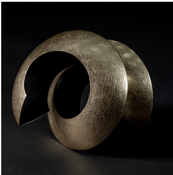
Hervé Wahlen, Torsion Or, 2021 - Mobilier national

In 2021, the Torsion Or lamp joined the prestigious Mobilier National collection. Subsequently, new versions of the Torsion lamp, including Moongold and White Gold, were exhibited at PAD London in 2022 and PAD Paris in 2023.