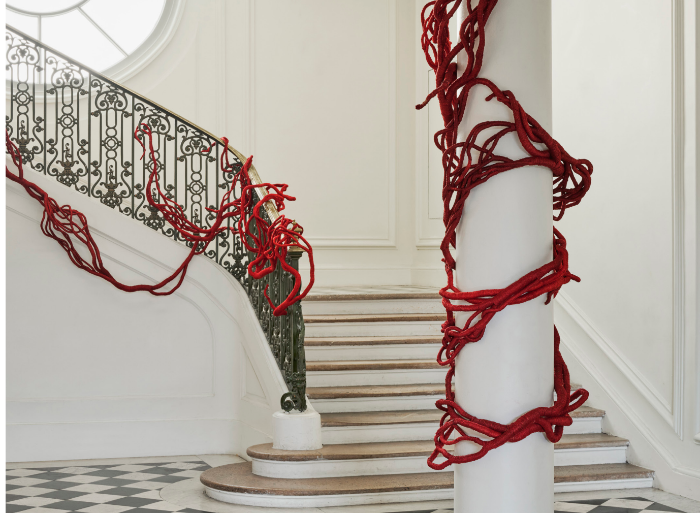
Rouge Opéra - 15 years, 15 artists, 15 works, 2023