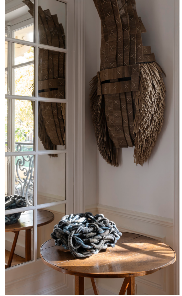
rand Nid d'Encre I, 2022

Working with linen allows Aude Franjou to touch, shape, knead, relax, and stretch the material solely through the power of her hands and imagination. She employs a coating technique, wrapping raw linen fibres with a finer thread made from the same fibres. This process is performed tirelessly, repeated twenty times, a hundred times regardless of weather conditions: Intense heat softens the material, while cold and humidity have the opposite effect, stiffening it.