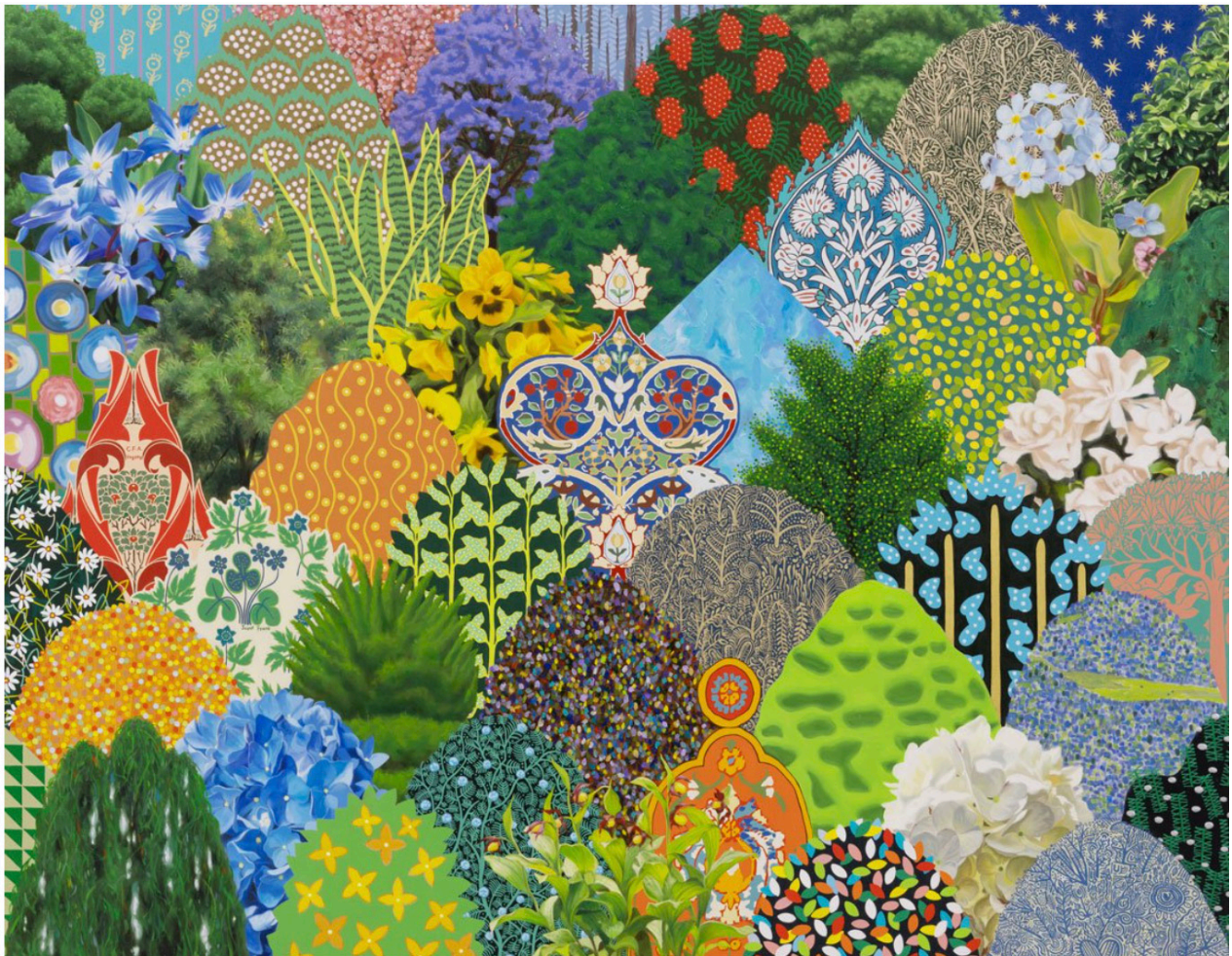
GALLERY LVS & CRAFT Kim Sung Kook, The Trees , 2024.