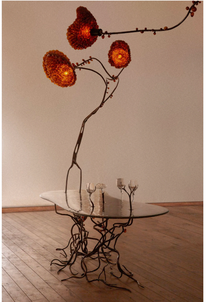
Left: PETER LAYTON LONDON GLASSBLOWING Peter Layton, Cloud . Right: SARAH MYERSCOUGH GALLERY Ori Orisun Merhav, Meet me Under the Insects Tree , 2024.