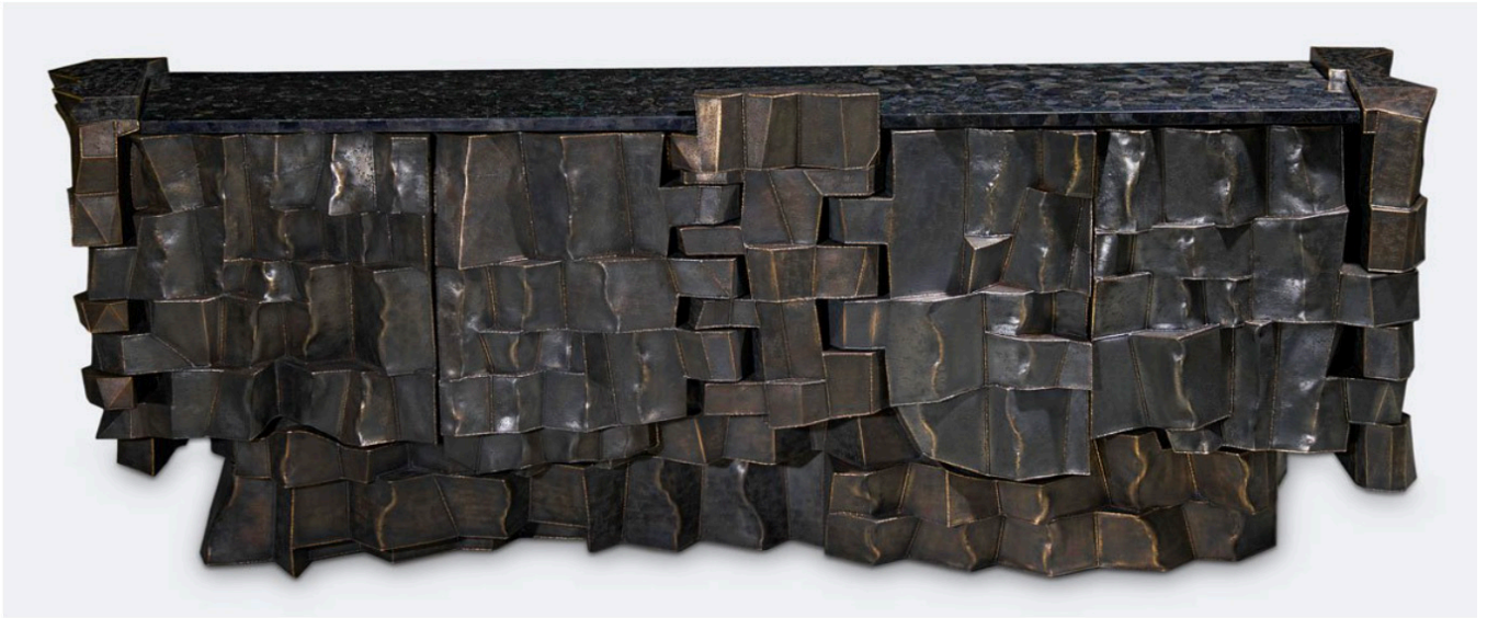
NILAFUR GALLERY Top: Pair of Hollywood Regency armchairs, James Mont , USA, circa 1950s. Left: 'Mod. 12383' floor lamp by Angelo Lelii for Arredoluce , Italy, 1951 Right: "X-Mix-Drix" by Shalom Harush, Italy, 2024. Bottom: "Shaded Graphite" console, Vikram Goyal Studio, Delhi, 2024.