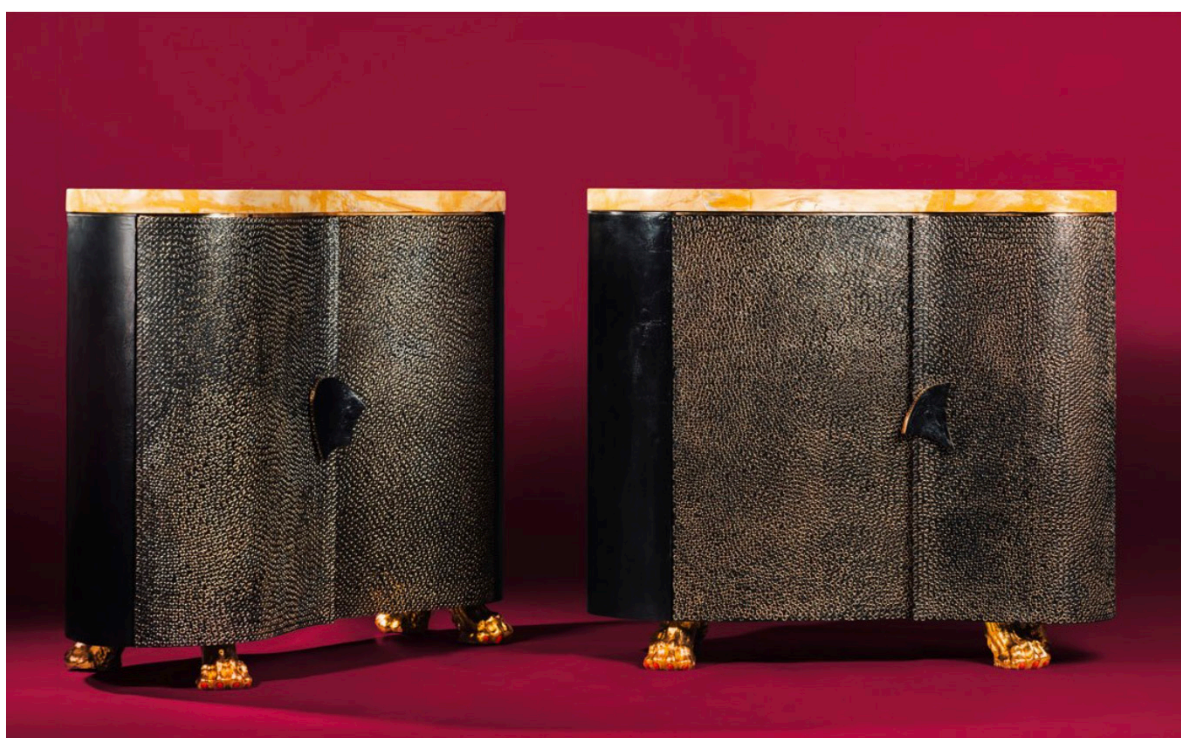
ACHILLE SALVAGNI ATELIER Castore Cabinet and Polluce Cabinet, 2023, by Achille Salvagni Atelier.