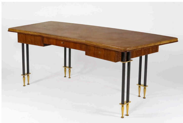
PORTUONDO Jules and André Leleu, President Desk, La Ligne L Series, circa 1957.

Now in its 16th year, the fair has the presence and confidence that grows with knowledge of its value and importance on the international stage. Dealers frequently reserve some of their most adventuresome and collectible material for the fair, eager to inspire and entice collectors, art consultants, museum curators, interior design specialists, design practitioners and the public. Here are some of this year's highlights.