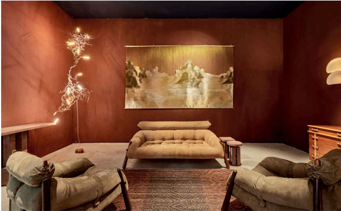
NILUFAR GALLERY Golden Landscape tapestry by Hechizoo, designed by Jorge Lizarazo, Colombia, 2024.