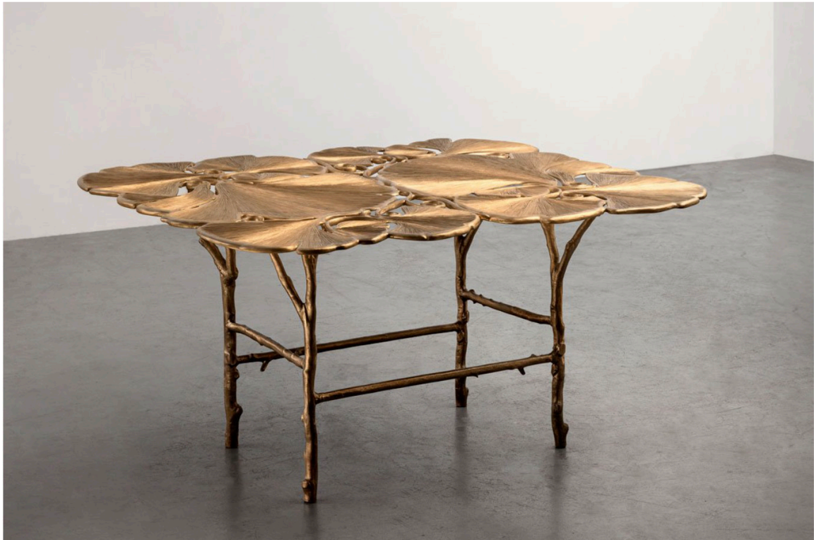
CARPENTERS WORKSHOP GALLERY Claude Lalanne , Ginkgo Dining Table.