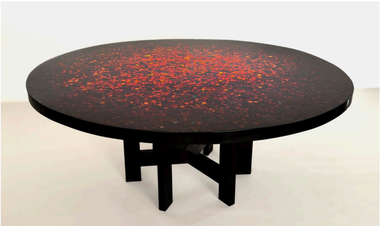
UNFORGET Dining or center table by Ado Chale , circa 1970.