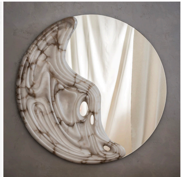
Left: RADEMAKERS GALLERY Joana Schneider, Blue Sea Orchid . Right: PRIVEEKOLLELTIE CONTEMPORARY ART | DESIGN Moon III by Amarist.