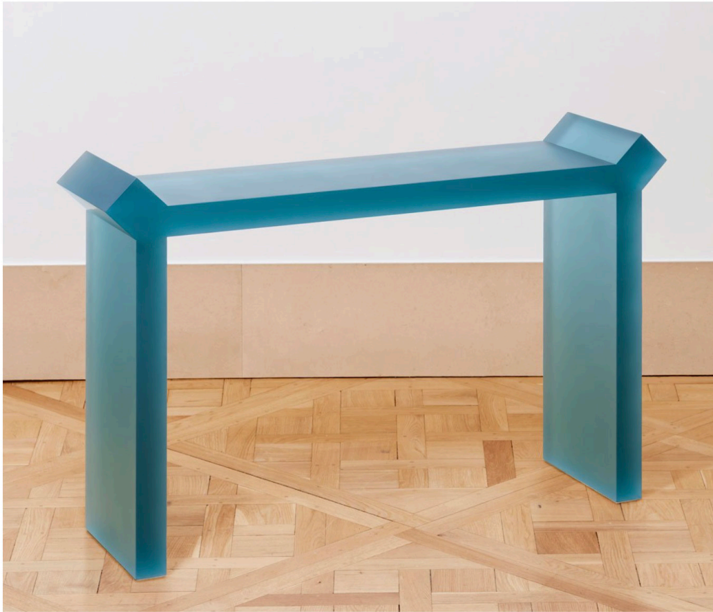
THEOREME EDITIONS Constantin Console by Francesco Balzano, designed in 2019, released in 2024.