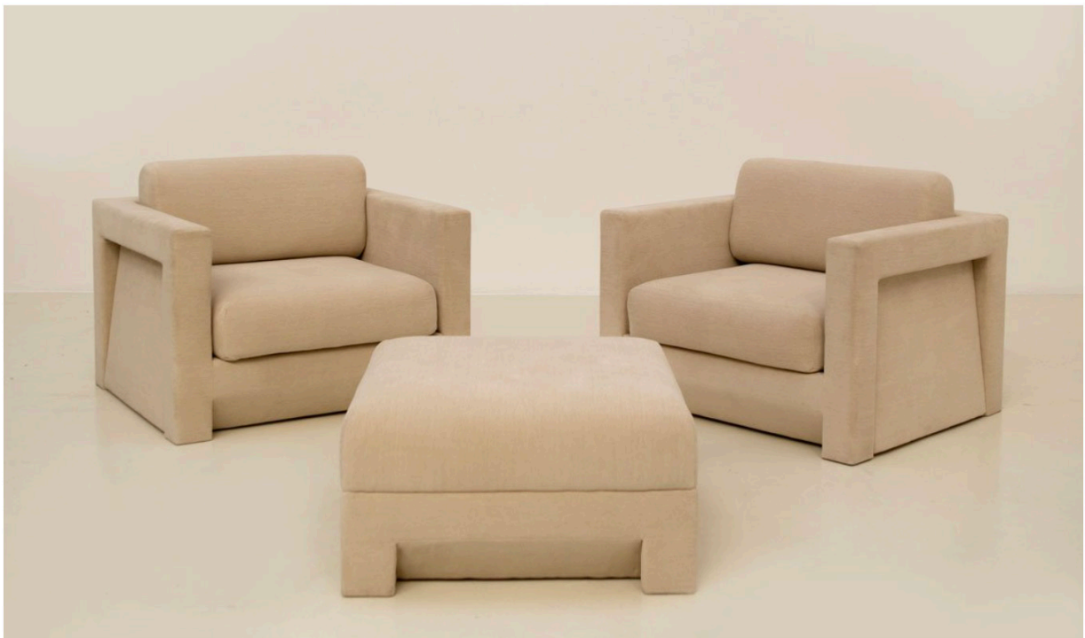
PRADIER-JEAUNEAU Ollie Armchair by Mathieu Delacroix for Pradier-Jeuneau, 2024.