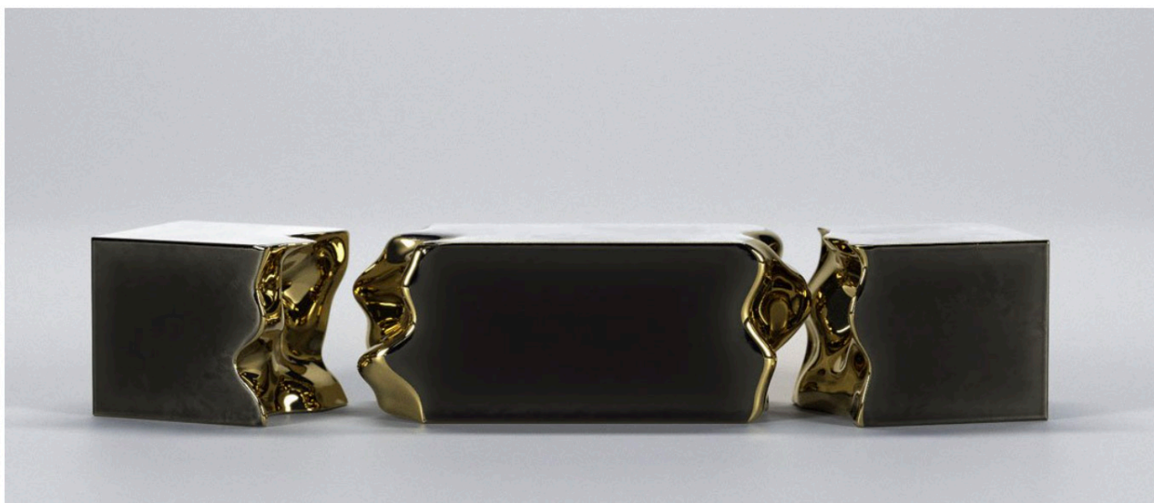
88 GALLERY Lava Bench Sculpture by Kris Lamba, 2024.

PAD London is a fabulously eclectic fair, mixing 20th-century and contemporary design with artwork spanning all periods and genres. The result is a unique, striking assemblage of collectible objects and images drawn from many of the best design and art galleries, united by a passion for the pleasures of beauty, interiors, and unexpected aesthetic connections.