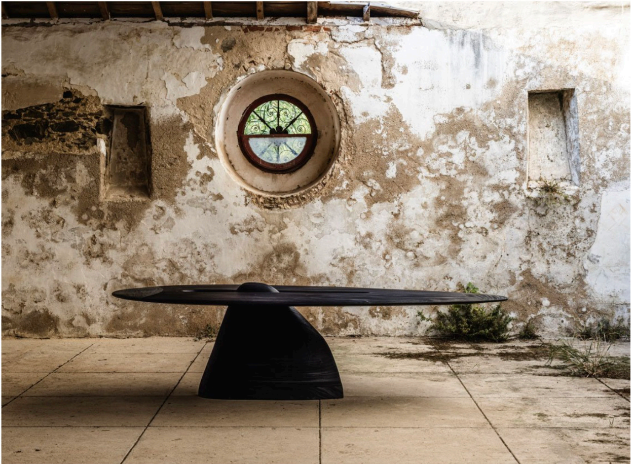
OBJECTS WITH NARRATIVES Mesa Preta Nova Table, 2024 by Mircea Anghel.