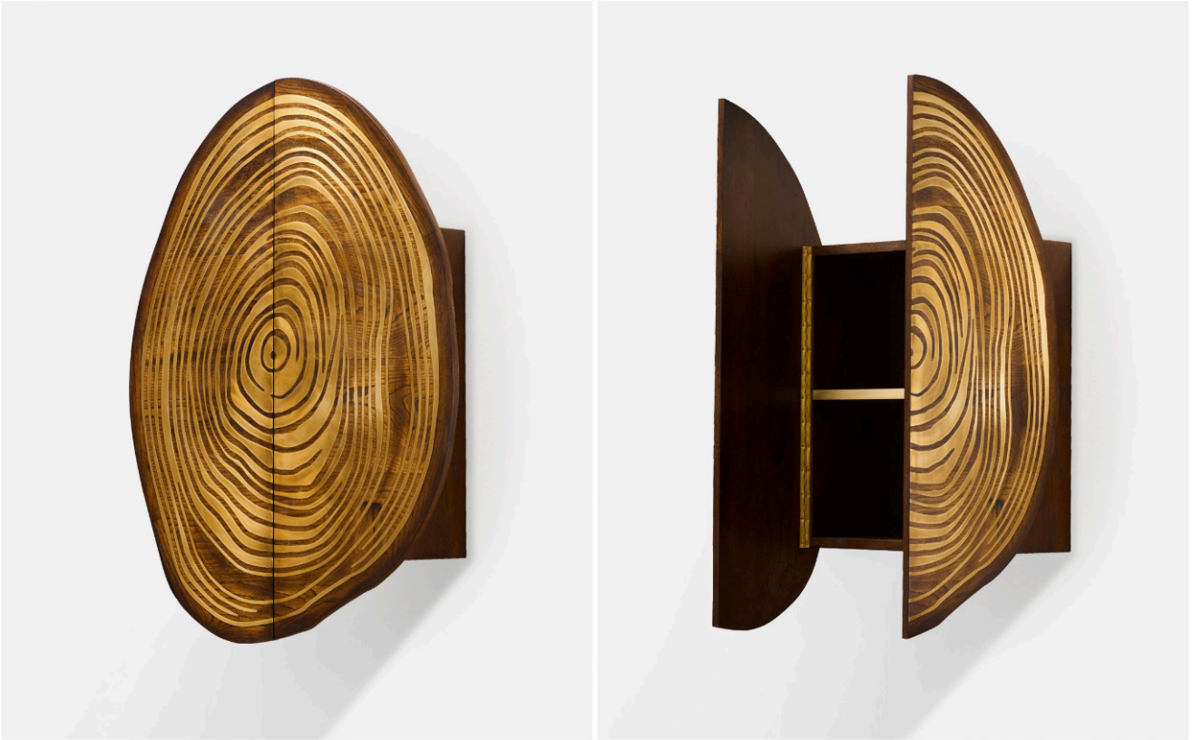
GALLEY FUMI Francesco Perini, Nucleo Wall Cabinet, 2024.