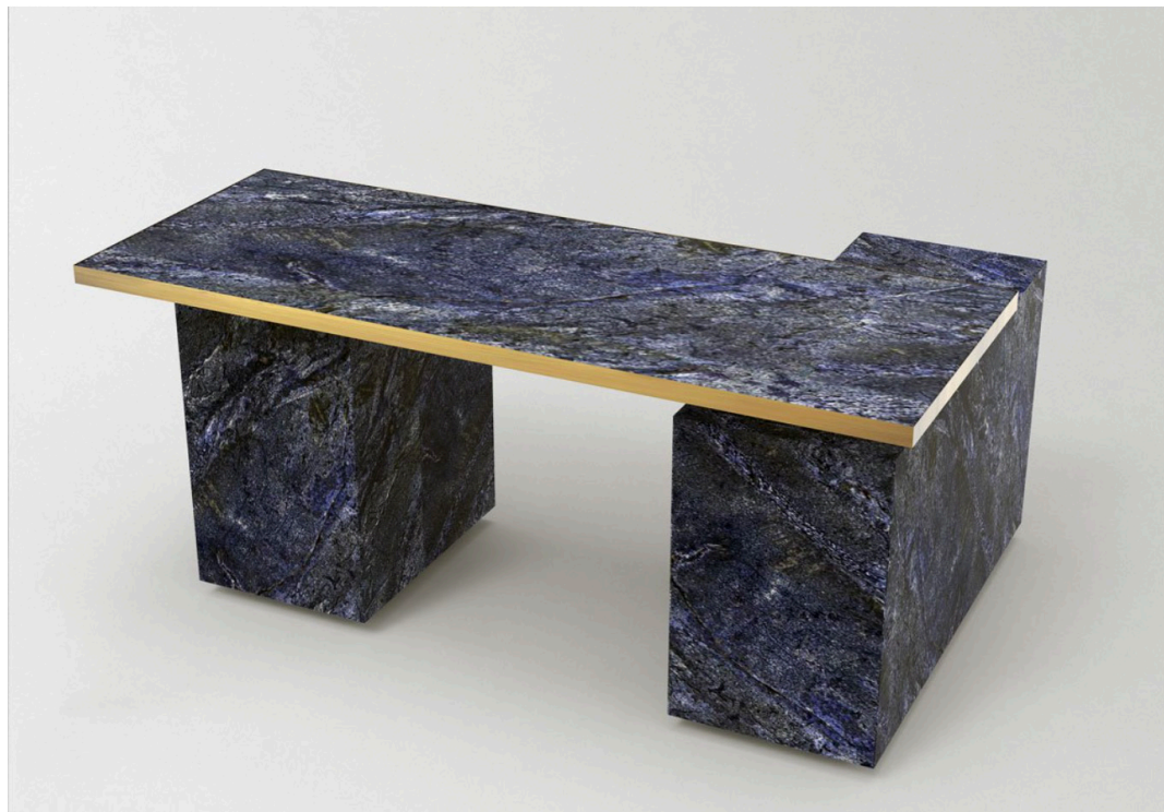
STUDIO WILLY RIZZO The Willy Rizzo Desk by Studio Willy Rizzo, 2024.