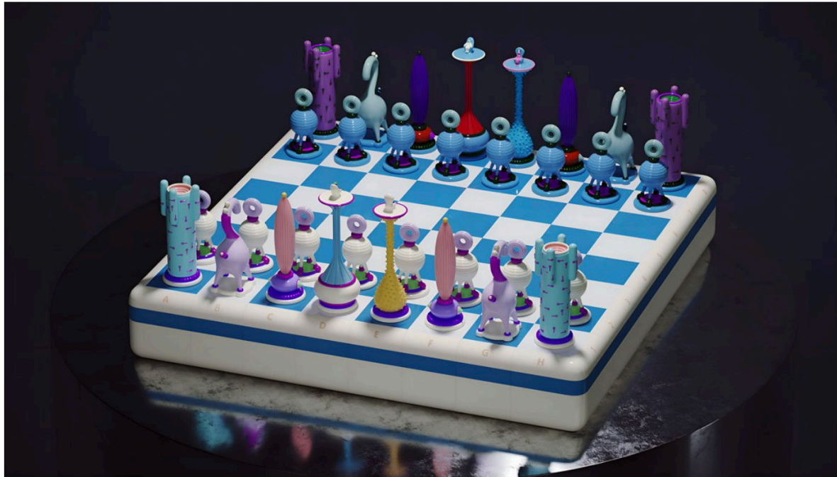
YOOMOOTA Another Kingdom: Light Stage by Taras Yoom.