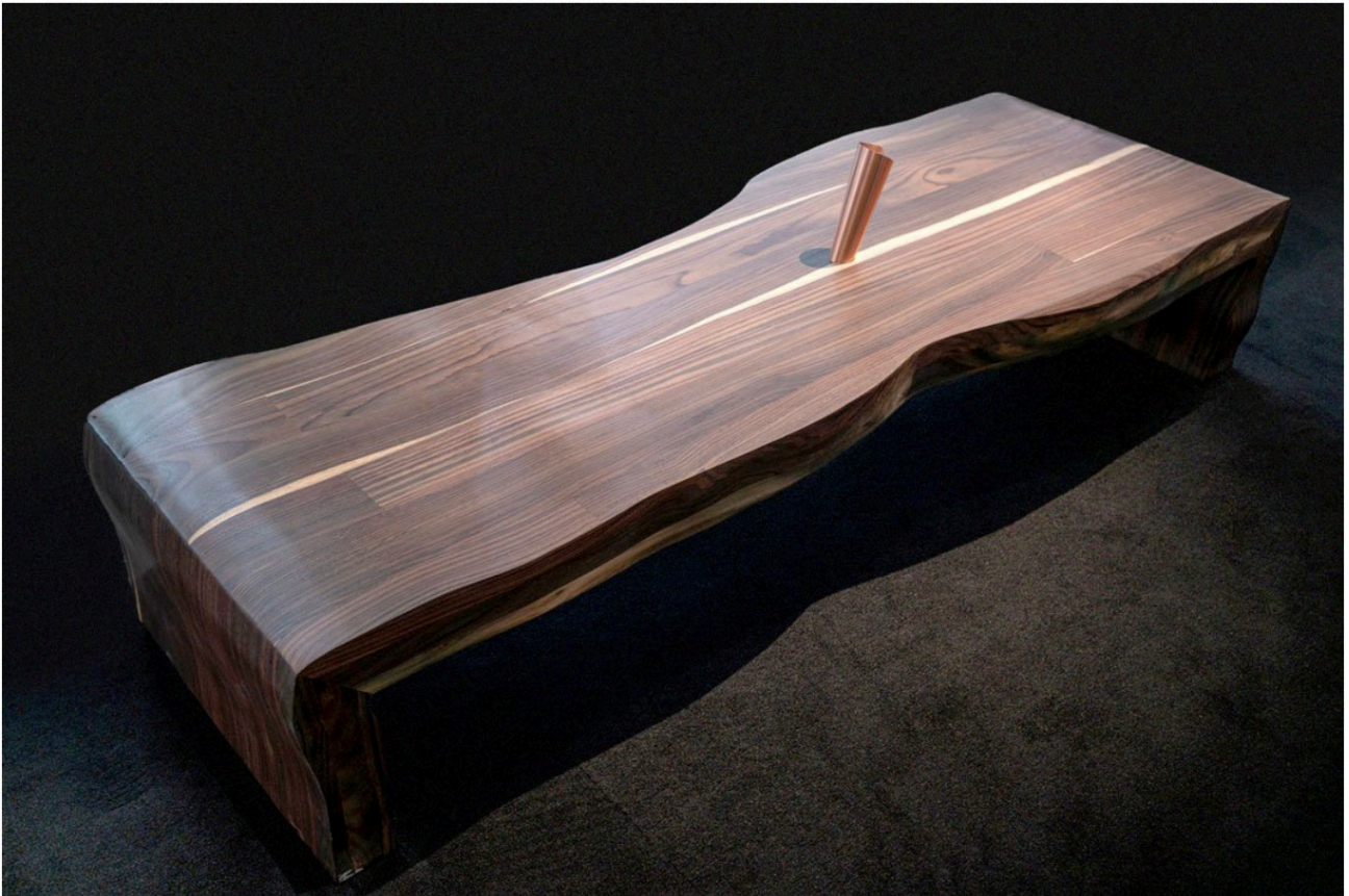
GALERIE PHILIPPE GRAVIER Rudy Ricciotti, Low Table with a Vase.