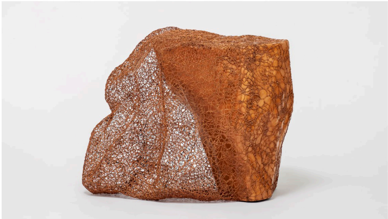
CHARLES BURNAND Kyeok Kim, Second Surface Ob11 Side Table , 2023.