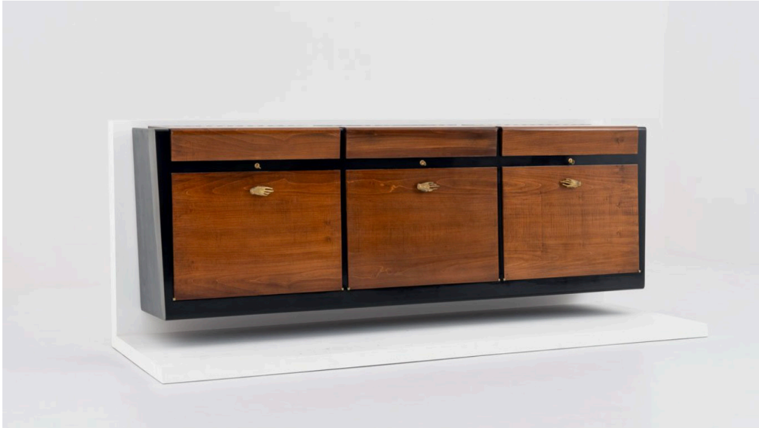
GALERIE GASTOU Suspended buffet by Jeanette Laverrière, 1953.