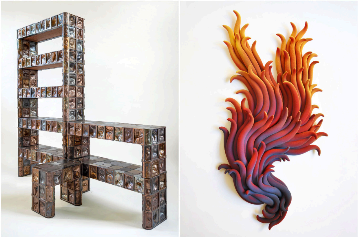
Left: GALERIE MELISSA PAUL Bookcase Shifting Forms by REM Atelier, 2024.

This year's event is once again in a tent in Berkeley Square in the middle of London's affluent Mayfair district. And once again the world's leading art and design galleries are in attendance, among them Portuondo, 88 Gallery , Charles Burnand , Maison Parisienne , Nilufar Gallery, Modernity, Carpenters Workshop Gallery, Gallery Fumi, Mia Karlova Galerie, Sarah Myerscough Gallery, Opera Gallery, Priveekollektie and David Zwirner.