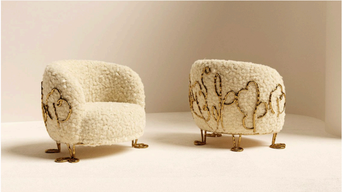
BRYAN O'SULLIVAN Spring 2024 Collection Armchairs.